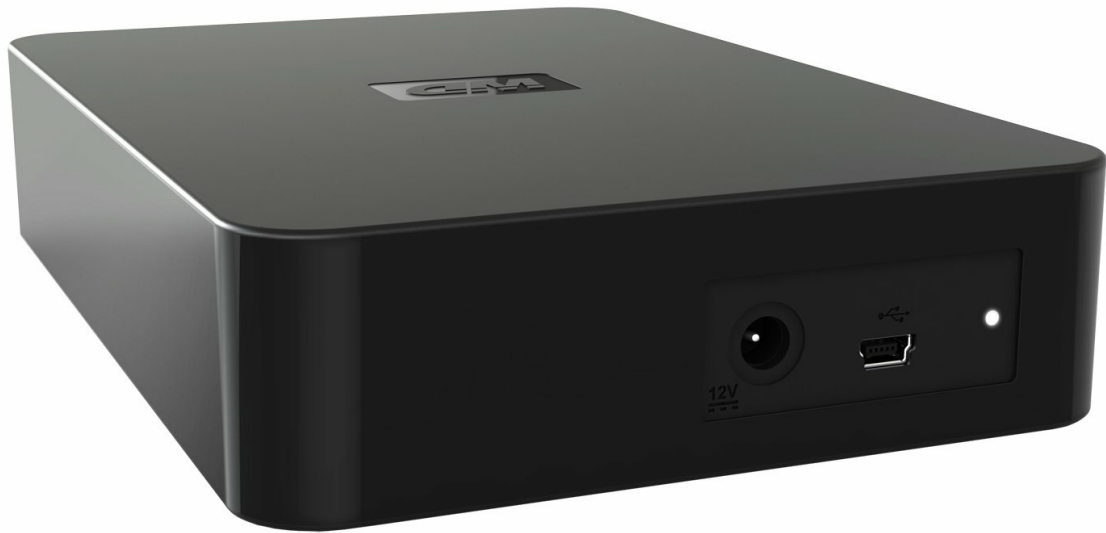
Image: The WD Elements external hard drive with its power and USB cables connected, ready for use.