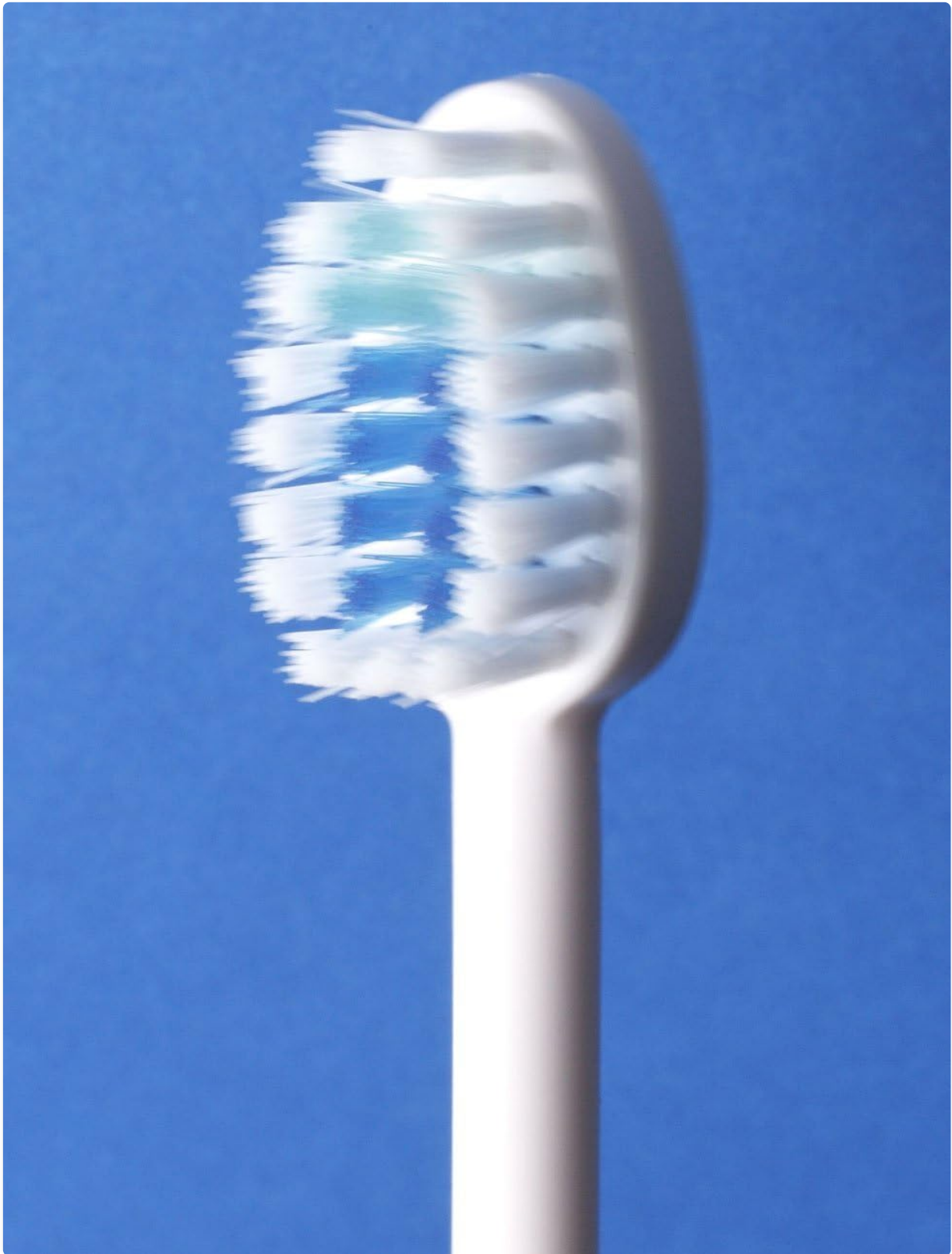
Image 5.1: Side view of the brush head. This perspective shows the profile of the bristles, which are designed to reach various surfaces of the teeth and gums.