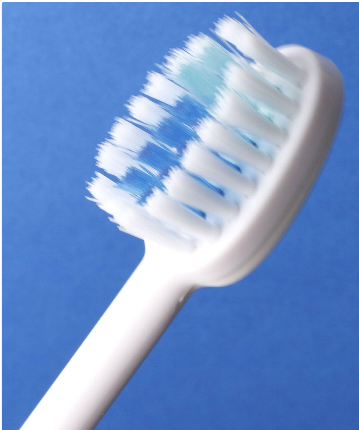
Image 6.1: Angled view of the brush head. This image provides another perspective of the brush head's design, useful for understanding how to attach and detach it.