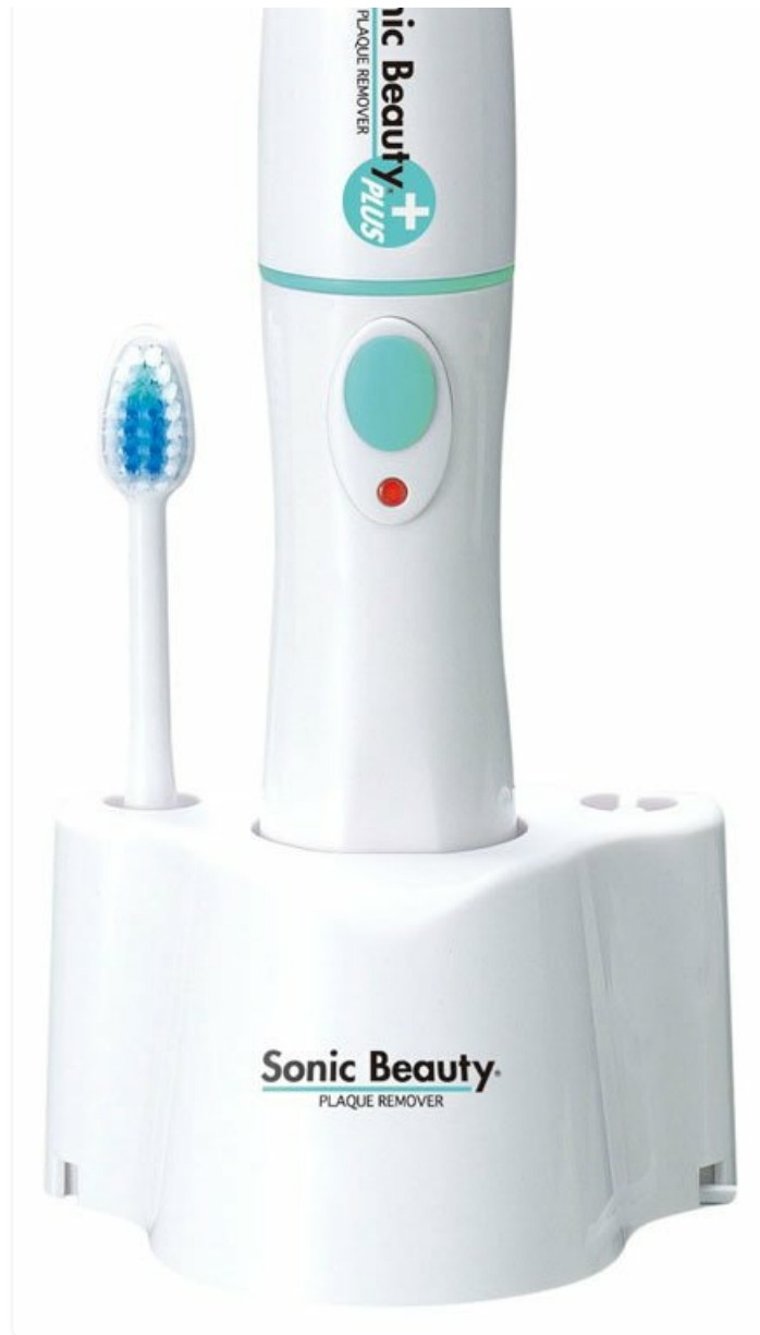
Image 1.1: The Winners Sonic Beauty Plus Electric Toothbrush SBT-1P. This image shows the complete electric toothbrush unit, including the handle and an attached brush head, against a plain background.