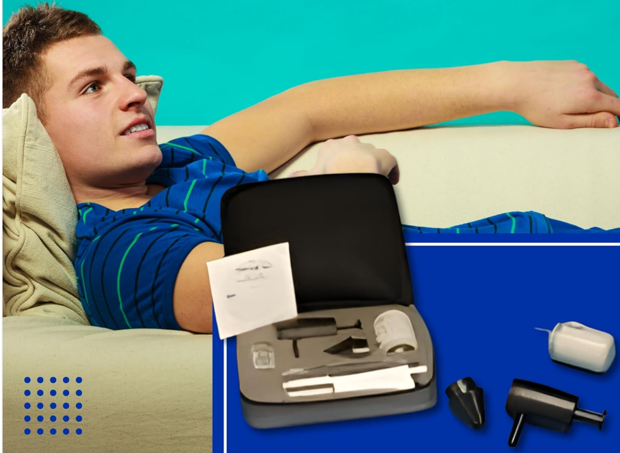
Figure 2.2: A selection of the seven different sized constriction rings included for personalized comfort and support.