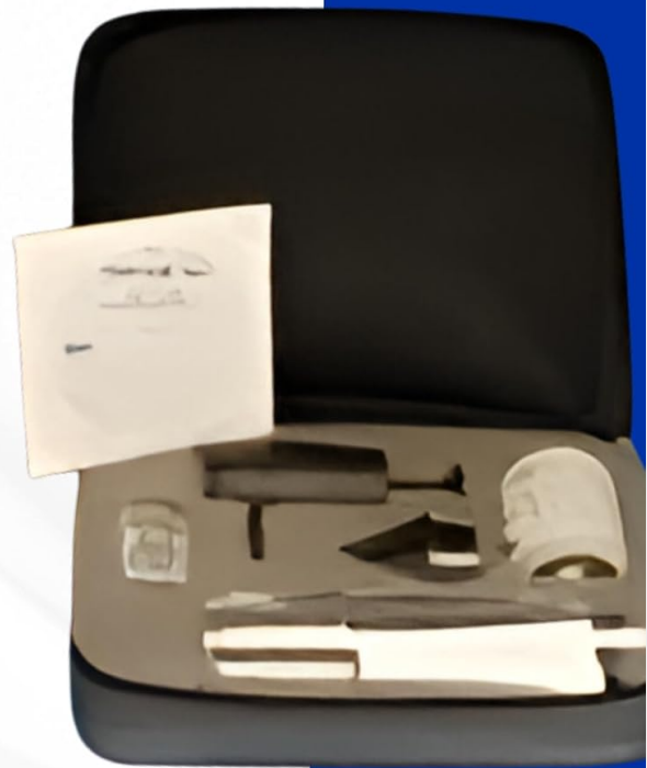
Figure 2.4: Included lubricant and the discreet carrying case with foam cutouts for organized storage and travel.

Comes with a tube of lubricant and zippered carrying case for convenient storage and travel