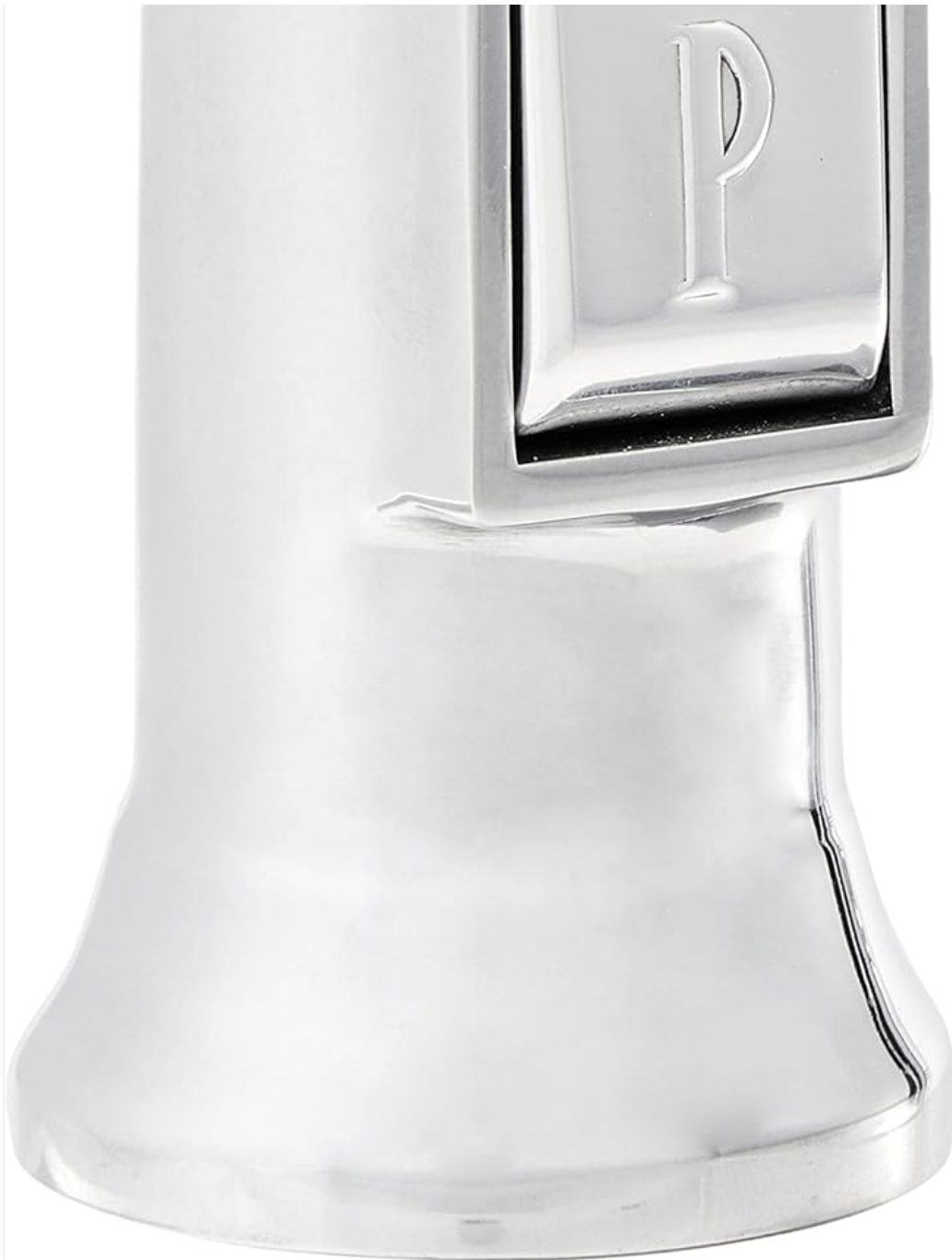
Image 1.1: The Perfix Adjustable Pepper Grinder Mill. This image displays the overall design of the pepper mill, highlighting its aluminum body and crank handle.