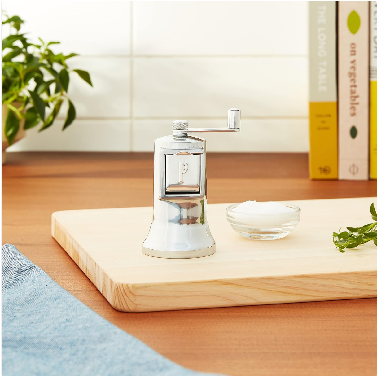
Image 3.1: The Perfix Pepper Grinder Mill positioned on a wooden cutting board, ready for use. This illustrates the mill in a typical kitchen setting.