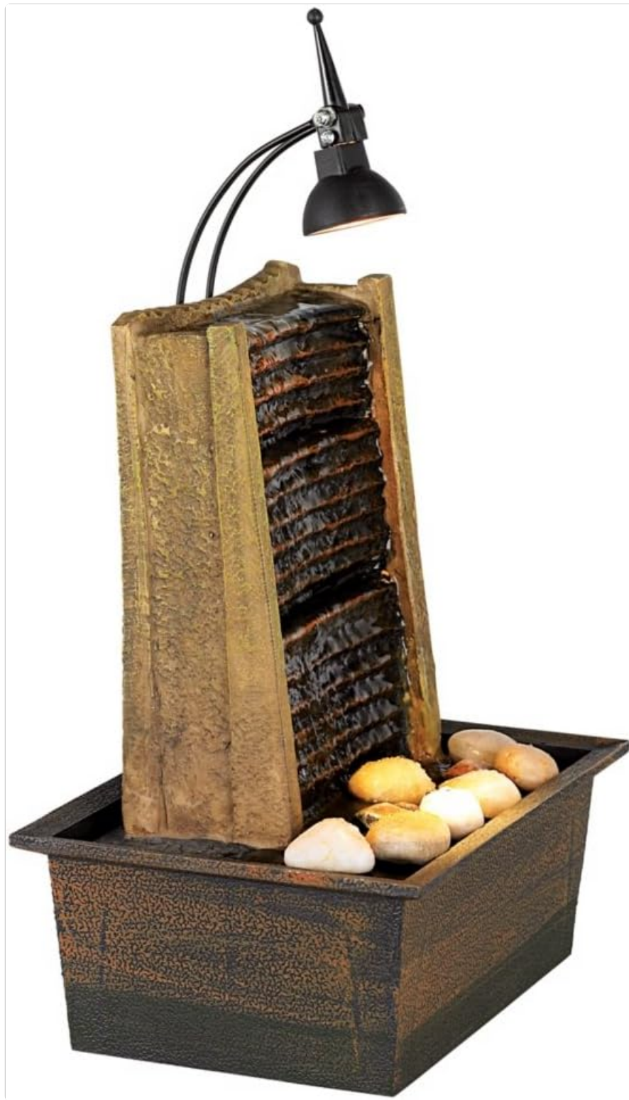
Image 2: A side view of the fountain, highlighting the placement of the adjustable LED light fixture at the top, designed to illuminate the cascading water.