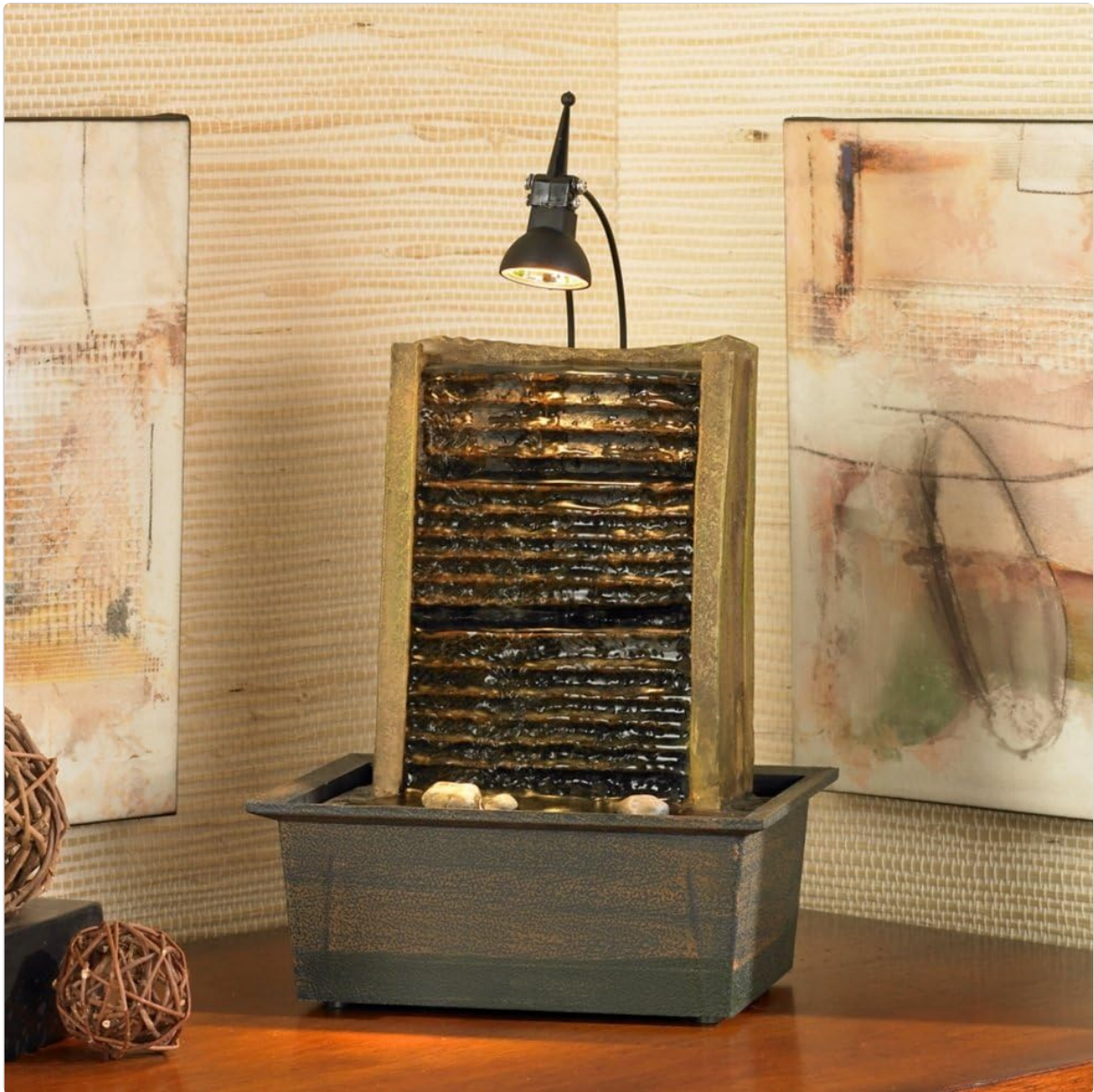
Image 4: A detailed view of the water cascading down the textured surface of the fountain's column, illuminated by the integrated LED light, creating a serene visual effect.