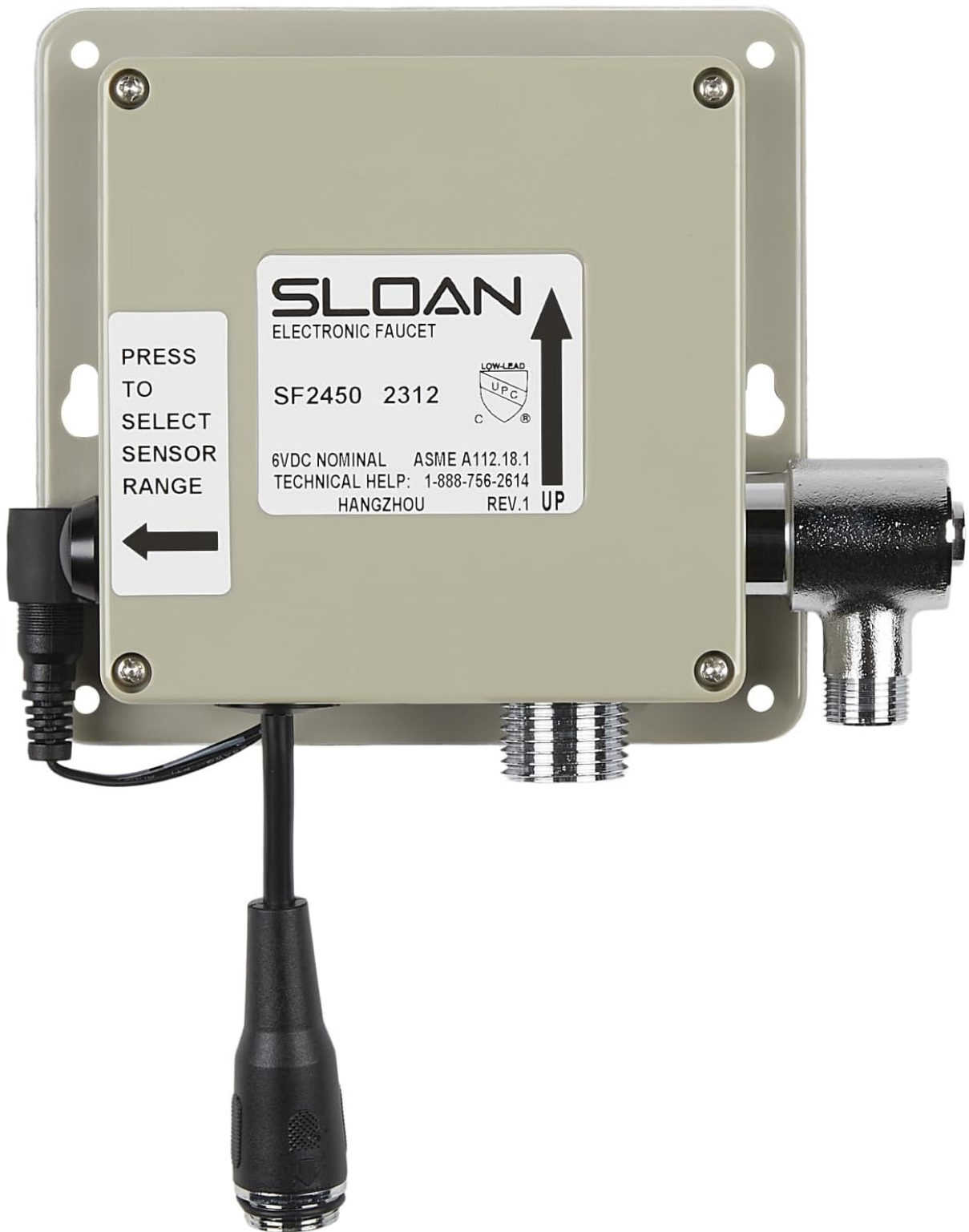
Image: Underside view of the Sloan SF-2400 faucet showing the mounting hardware and connections for installation.