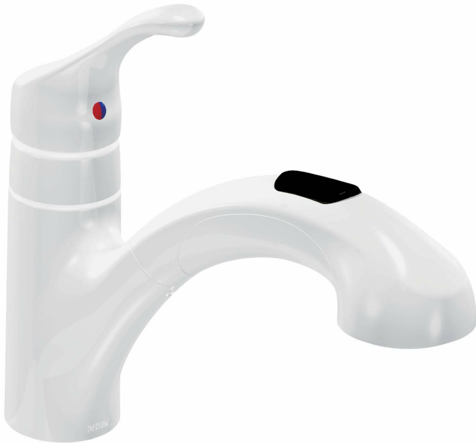
Image 1.1: Moen CA87316W One-Handle Low Arc Pullout Kitchen Faucet in Glacier finish. This image shows the complete faucet unit with its single handle and integrated pullout spray head.