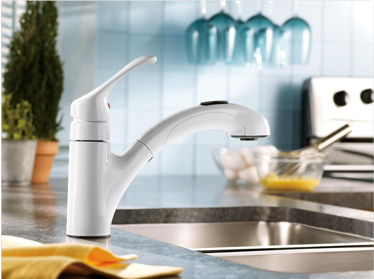
Image 5.1: The Moen CA87316W faucet in a kitchen environment, demonstrating its functional design and Glacier finish.

The pullout spray head provides flexibility for various kitchen tasks. To use, simply pull the spray head from the spout. Press the button located on the spray head to switch between an aerated stream for general washing and a powerful rinse for heavy-duty cleaning. The integrated Power Clean spray technology delivers 50 percent more spray power compared to standard pullout faucets.