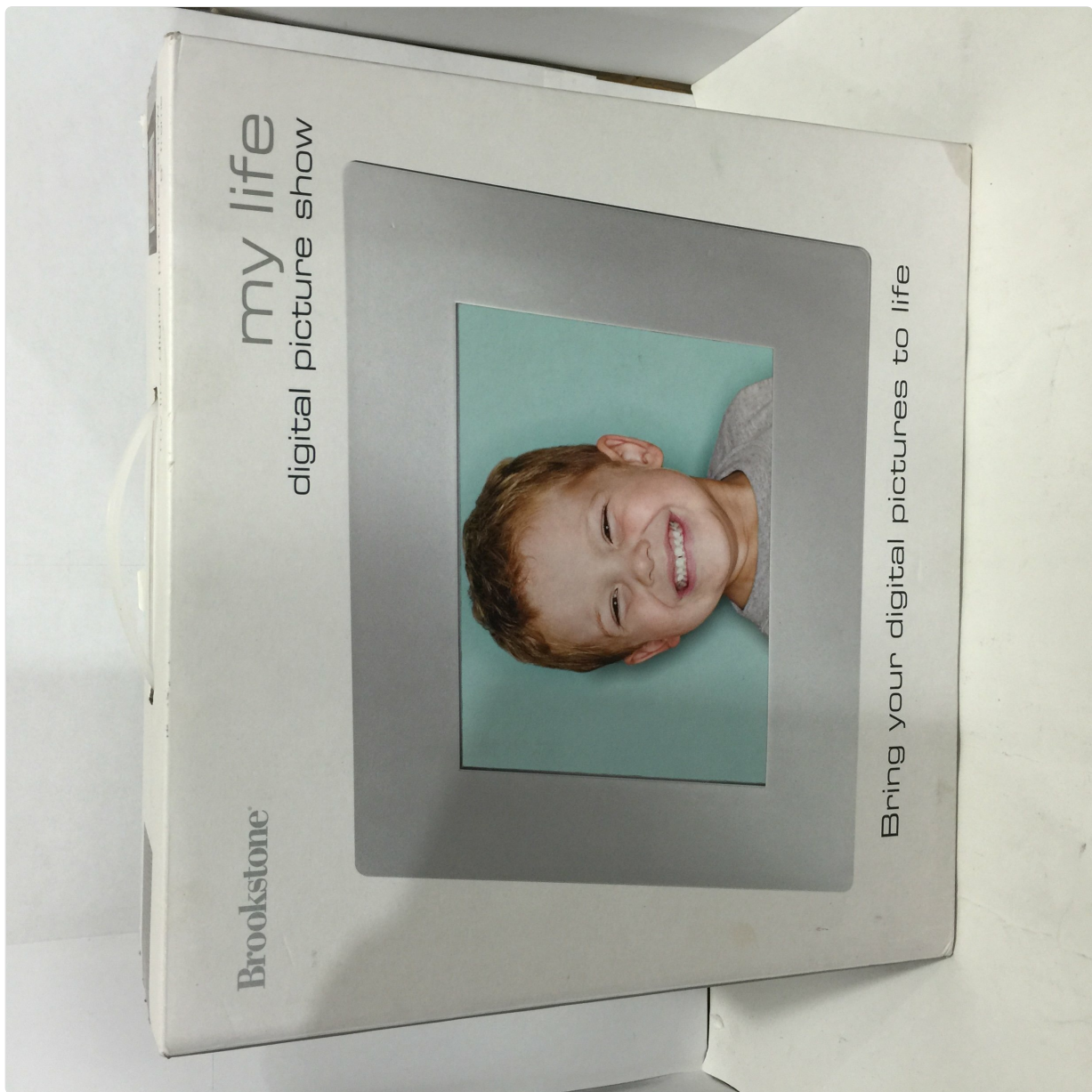
Figure 3.1: Product packaging and contents.