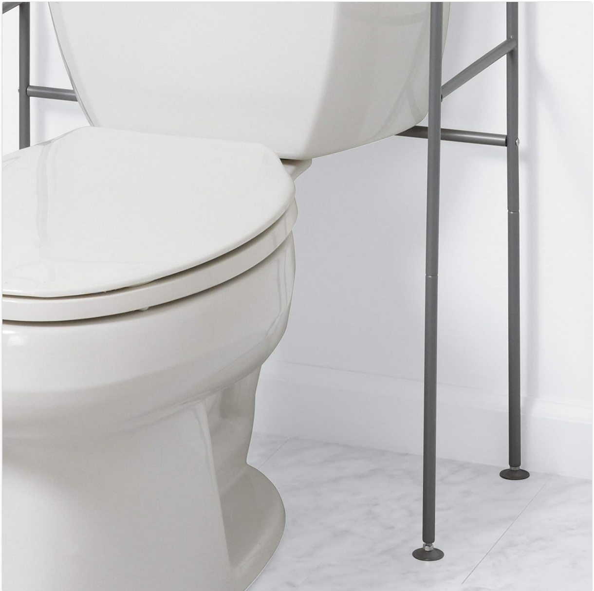
Figure 4.1: Detail of the spacesaver's base, illustrating how it fits around the toilet and the presence of adjustable feet for leveling.