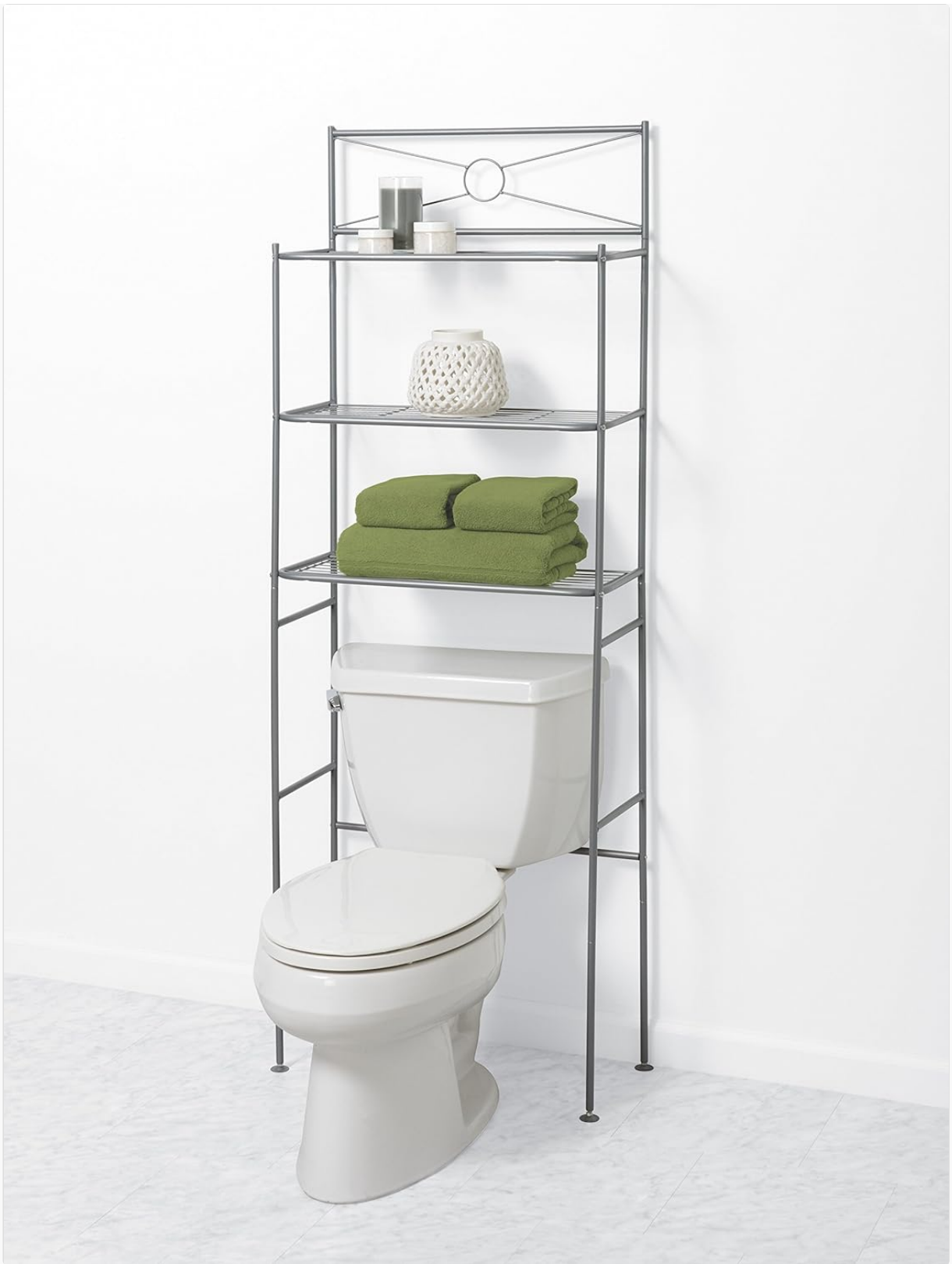
Figure 2.2: The spacesaver installed over a toilet, demonstrating its intended use and fit within a bathroom environment.