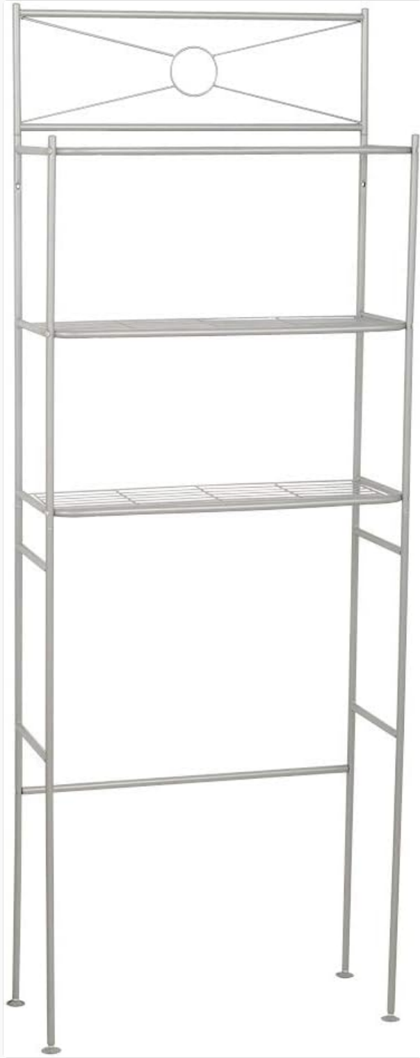
Figure 2.1: Front view of the Zenna Home Over-the-Toilet Bathroom Spacesaver.