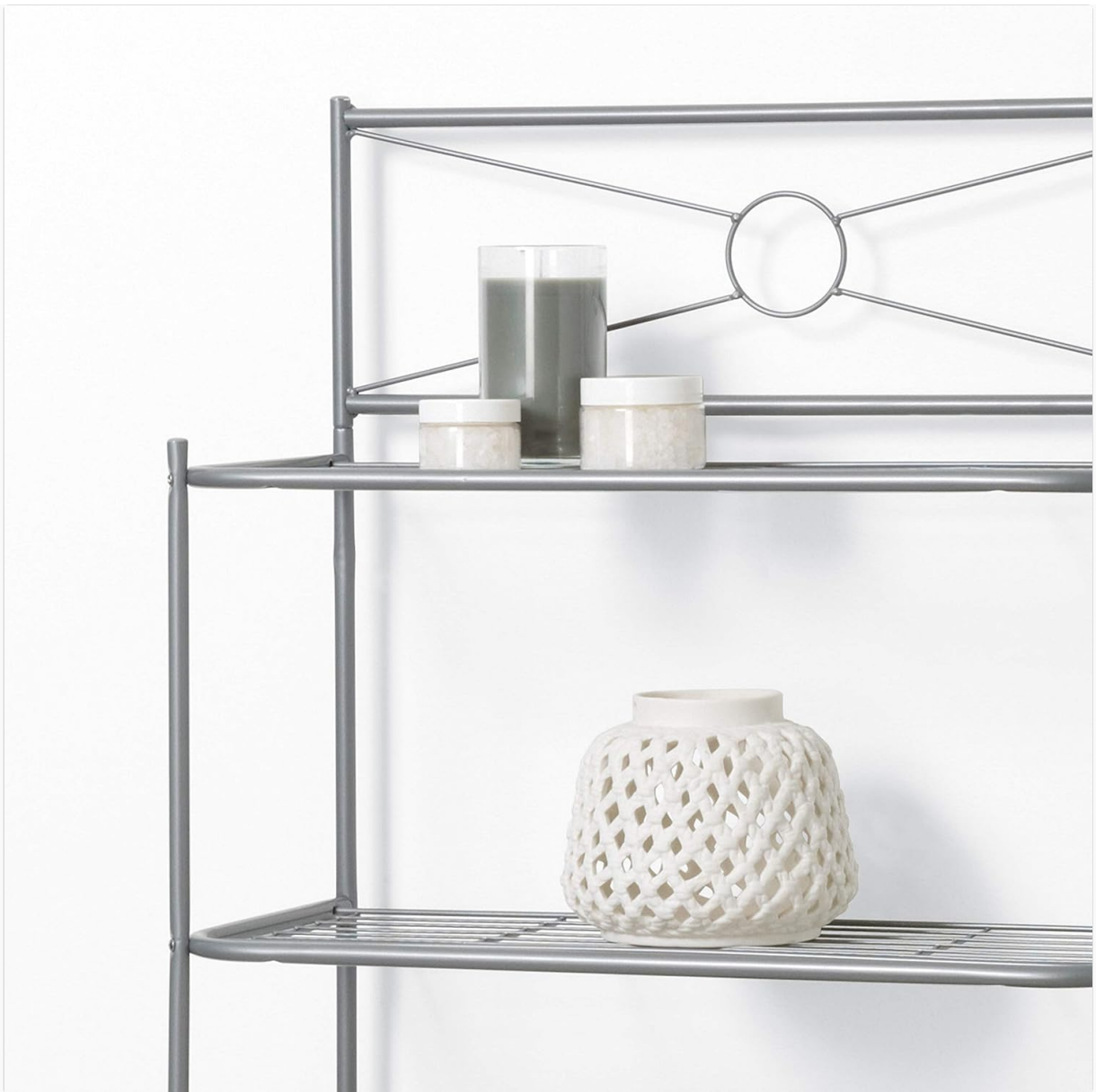
Figure 5.1: A close-up of the shelves, demonstrating how various items can be organized and displayed.