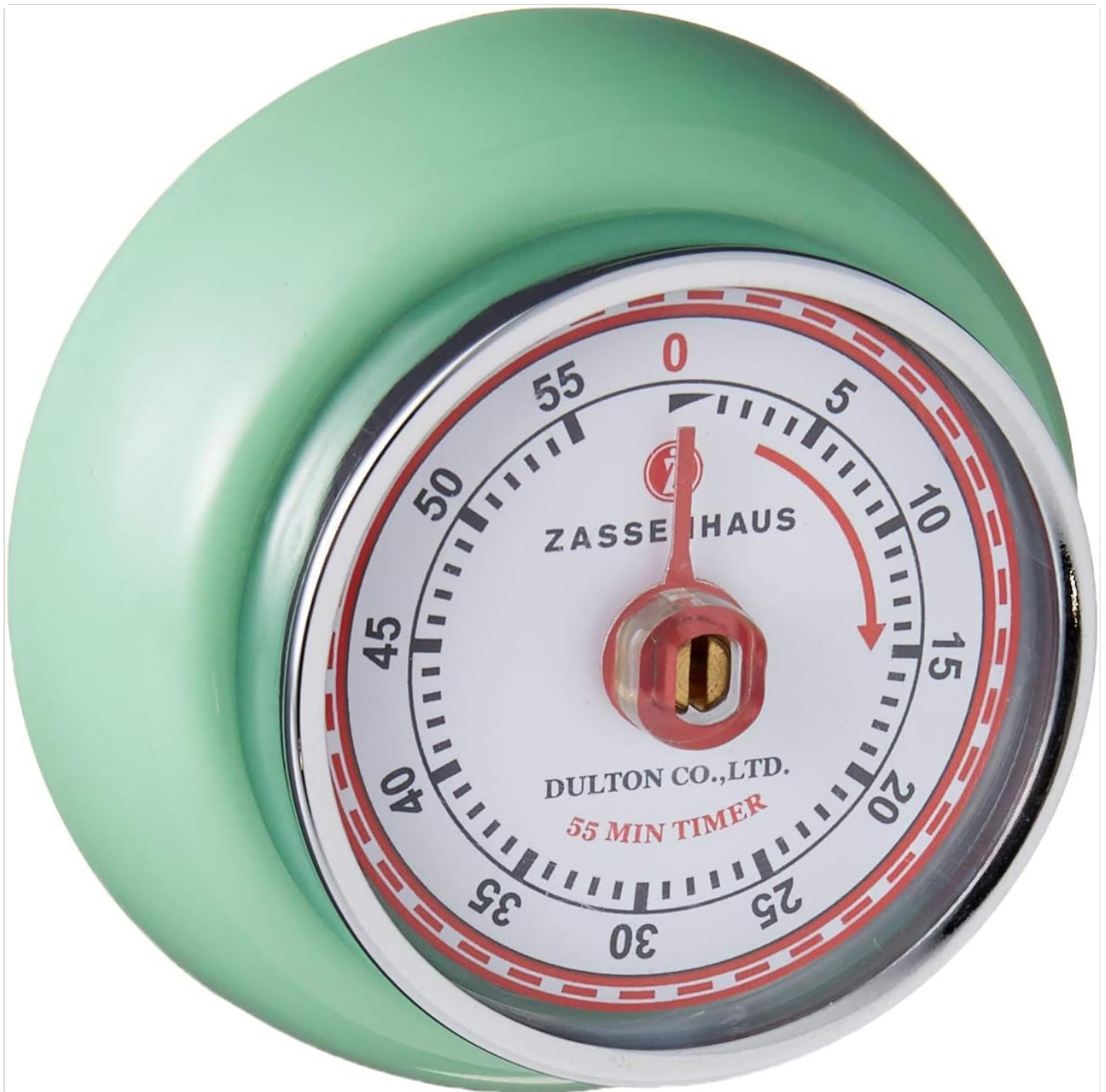
Image 1: Angled view of the Zassenhaus Magnetic Retro Kitchen Timer in Mint Green.