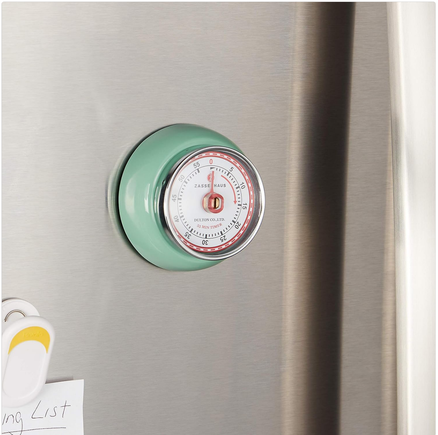
Image 4: The Zassenhaus timer shown attached magnetically to a refrigerator door.