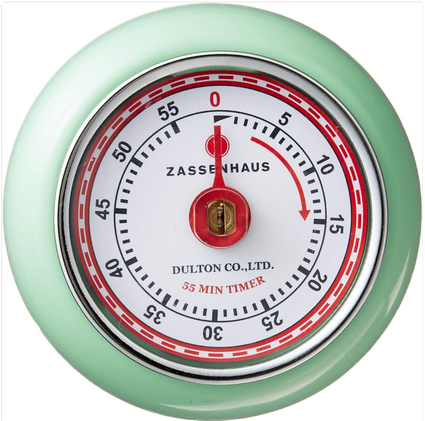
Image 2: Front view of the timer, showing the dial and minute markings.

Important Note on Alarm Volume: For the loudest and most consistent alarm, it is crucial to always wind the timer fully to 55 minutes before setting it to your desired time. If the timer is only partially wound (e.g., directly set to 5 minutes without first winding to 55), the alarm may be quieter or ring for a shorter duration.