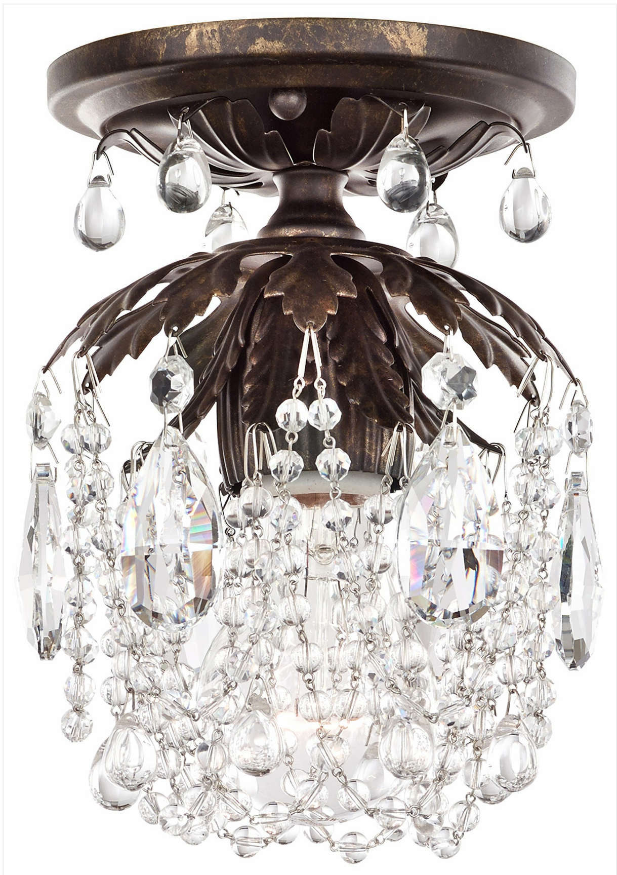
Image: The Schonbek 1250-26BD Rondelle Semi Flush Mount Lighting Fixture in French Gold.