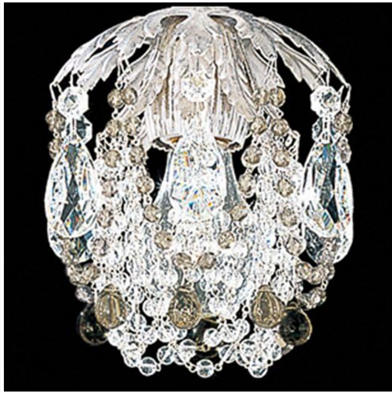
Image: The intricate crystal assembly of the fixture, showing various crystal shapes and their arrangement.