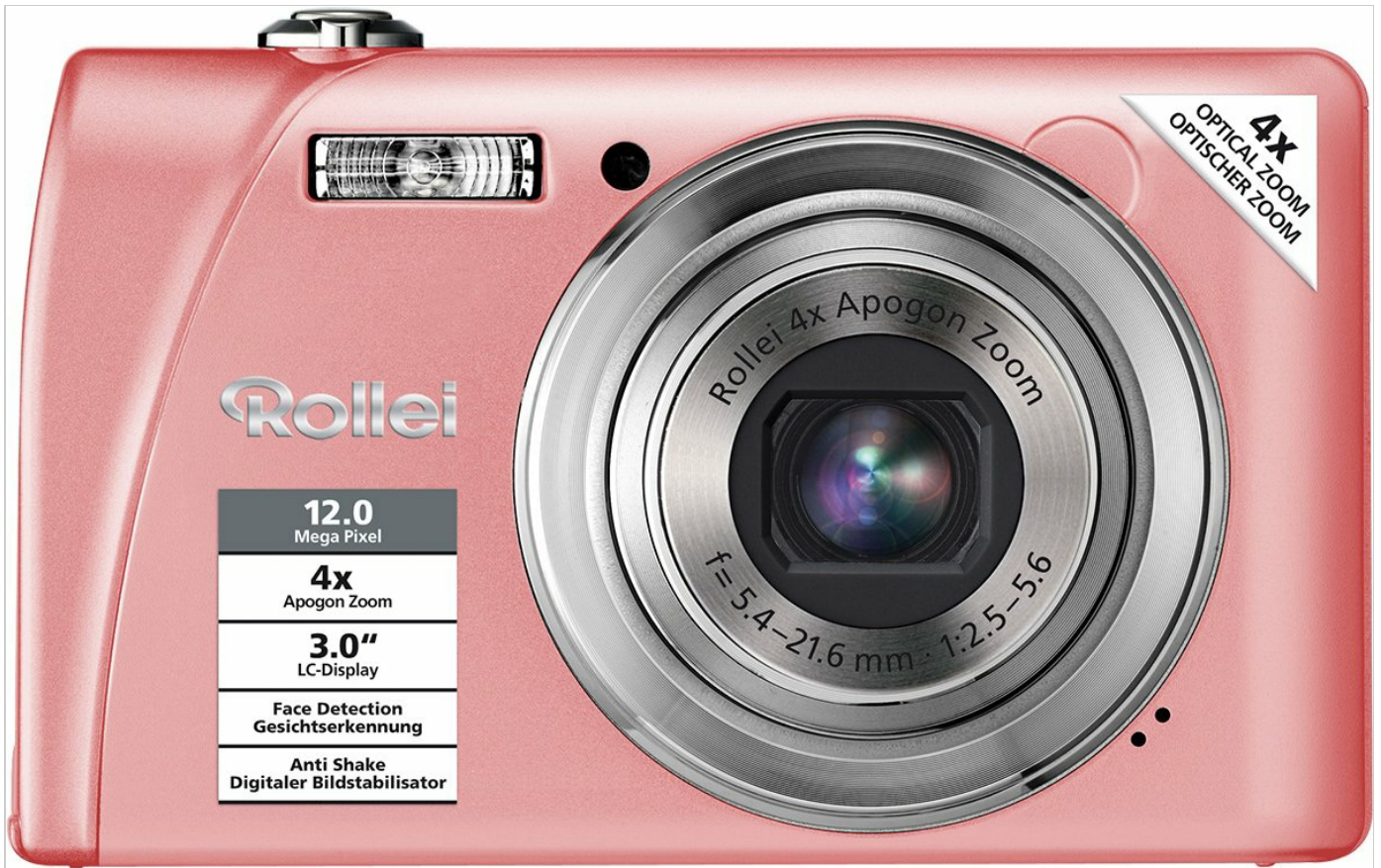
Image: Front view of the camera, highlighting the lens, flash, and key features like 12 Megapixel resolution and 4x Optical Zoom.