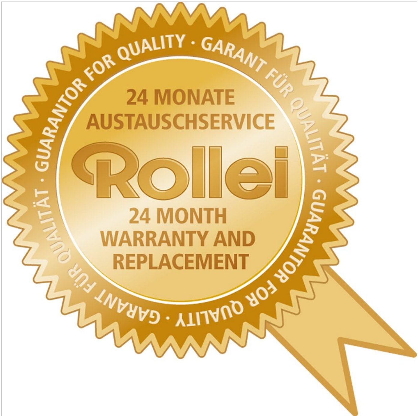
Image: Rollei 24-month warranty and replacement service seal.

Please refer to the official Rollei website or the contact information provided in your product packaging for the most up-to-date support details.