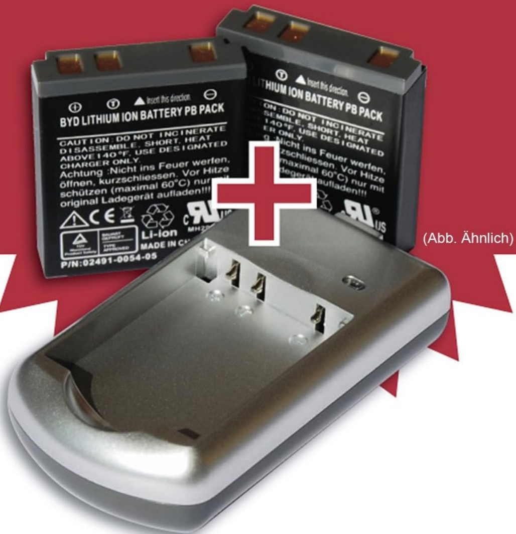
Image: Included rechargeable batteries and charging station.