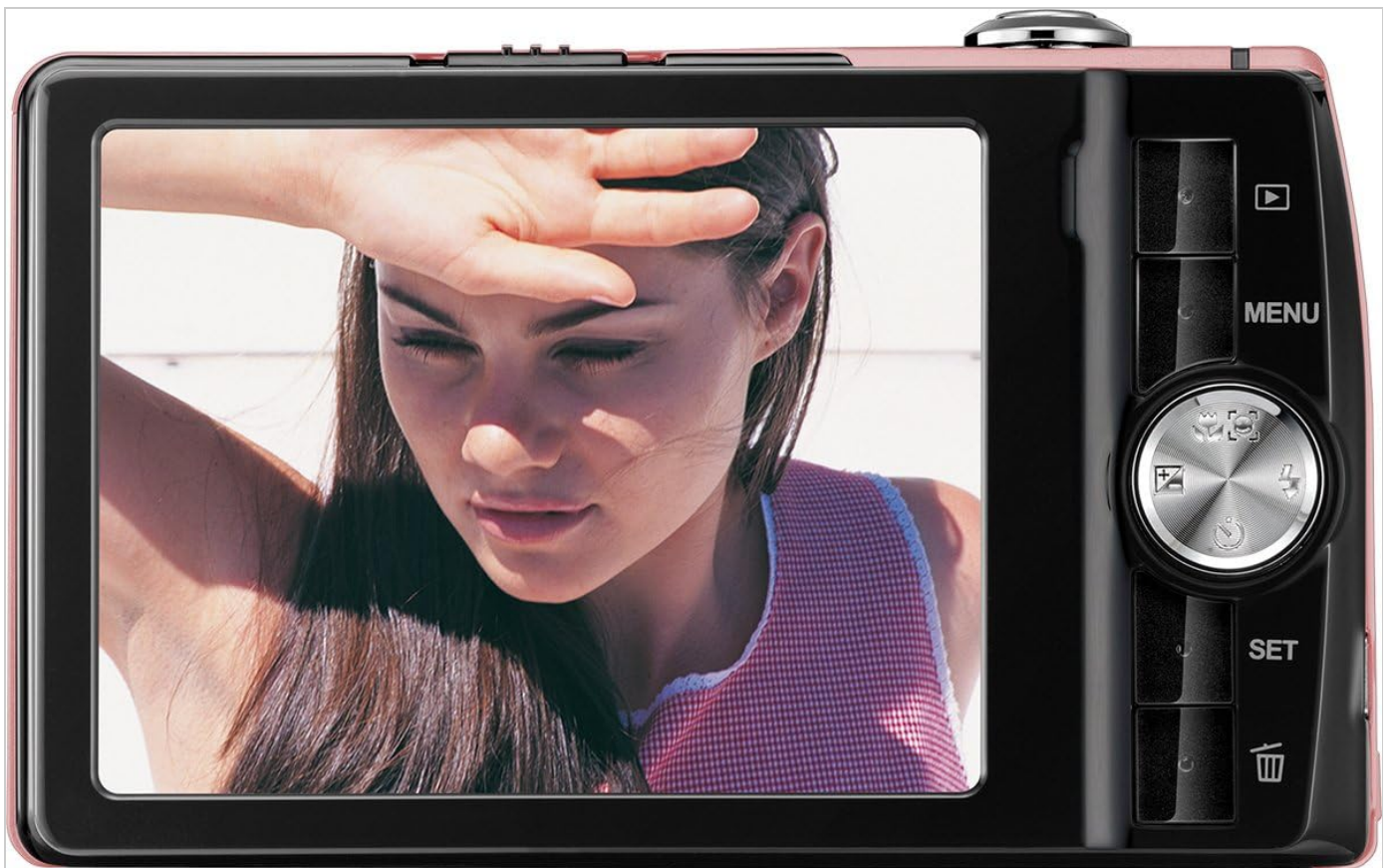
Image: Rear view of the camera, displaying the LCD screen and control panel with navigation buttons and menu access.