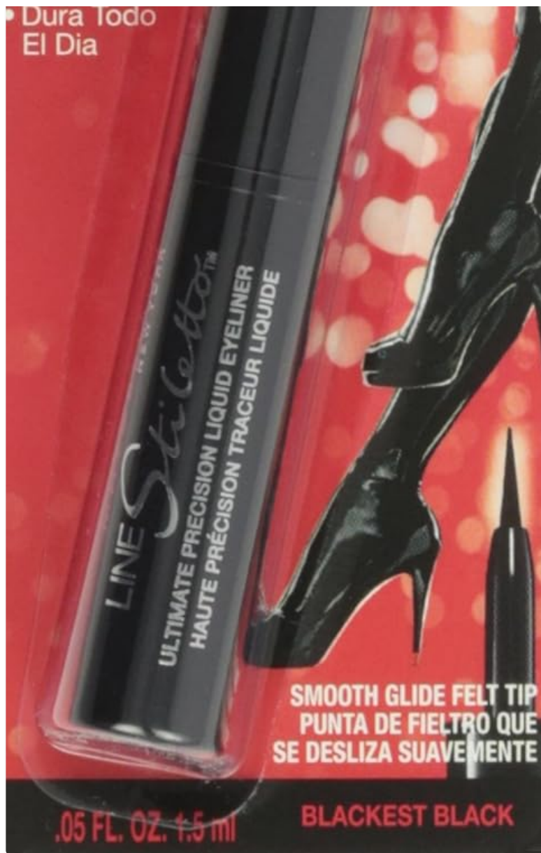
The product is shown in its original retail packaging, emphasizing its ability to create slender lines and provide all-day wear.