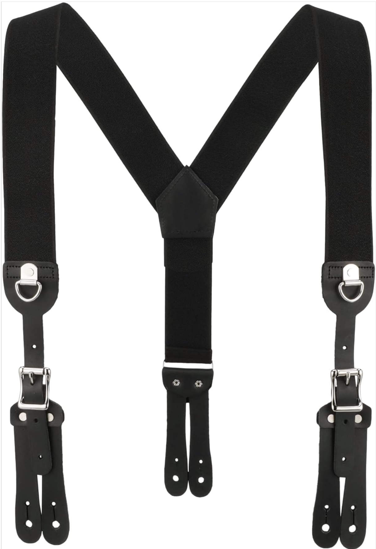
Image: Front view of the Welch Work Suspenders, showcasing the Y-back design, 2-inch wide black elastic straps, and leather button-on ends with D-rings.