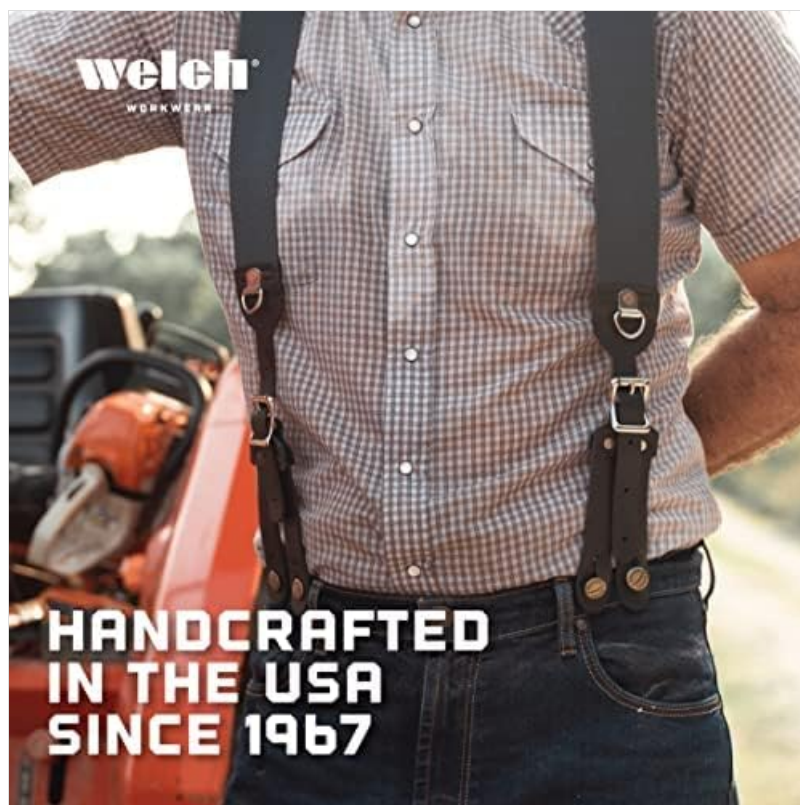
Image: A person wearing the Welch Work Suspenders with a work shirt and jeans, demonstrating the Y-back design and how the suspenders are worn.