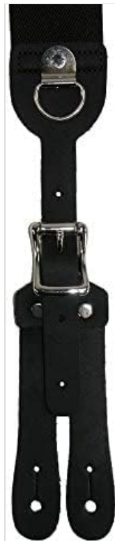
Image: Close-up view of the leather button-on attachment mechanism of the suspenders, showing the holes for securing to pant buttons.

These suspenders feature a button-on attachment system. Ensure your pants have buttons sewn onto the waistband at the appropriate positions (typically two in the front and one or two in the back for a Y-back design). Thread the leather button ends through the buttonholes and secure them to the buttons on your pants.