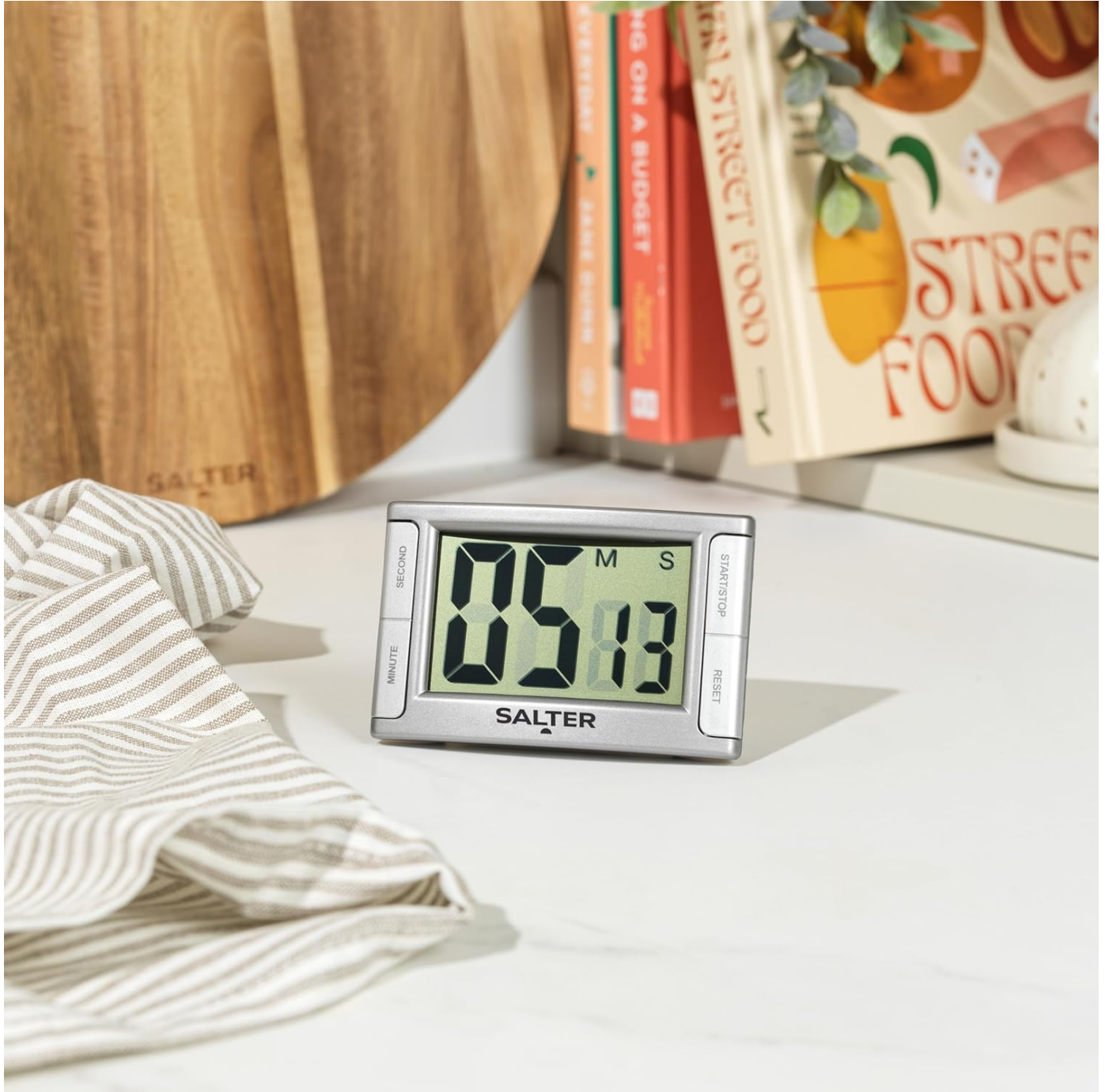
Image description: The Salter 396 SVXR digital kitchen timer is shown on a light-colored kitchen counter, displaying "05 M 13 S". It is positioned next to a wooden cutting board and a striped kitchen towel, indicating its use in a kitchen environment.