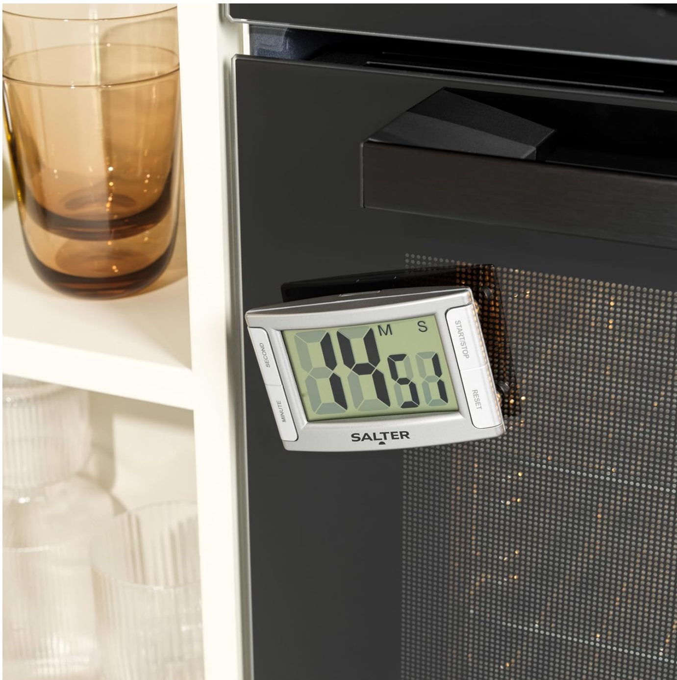
Image description: The Salter 396 SVXR digital kitchen timer is shown magnetically attached to the side of a black oven, displaying "14 M 51 S". This demonstrates its magnetic placement capability.