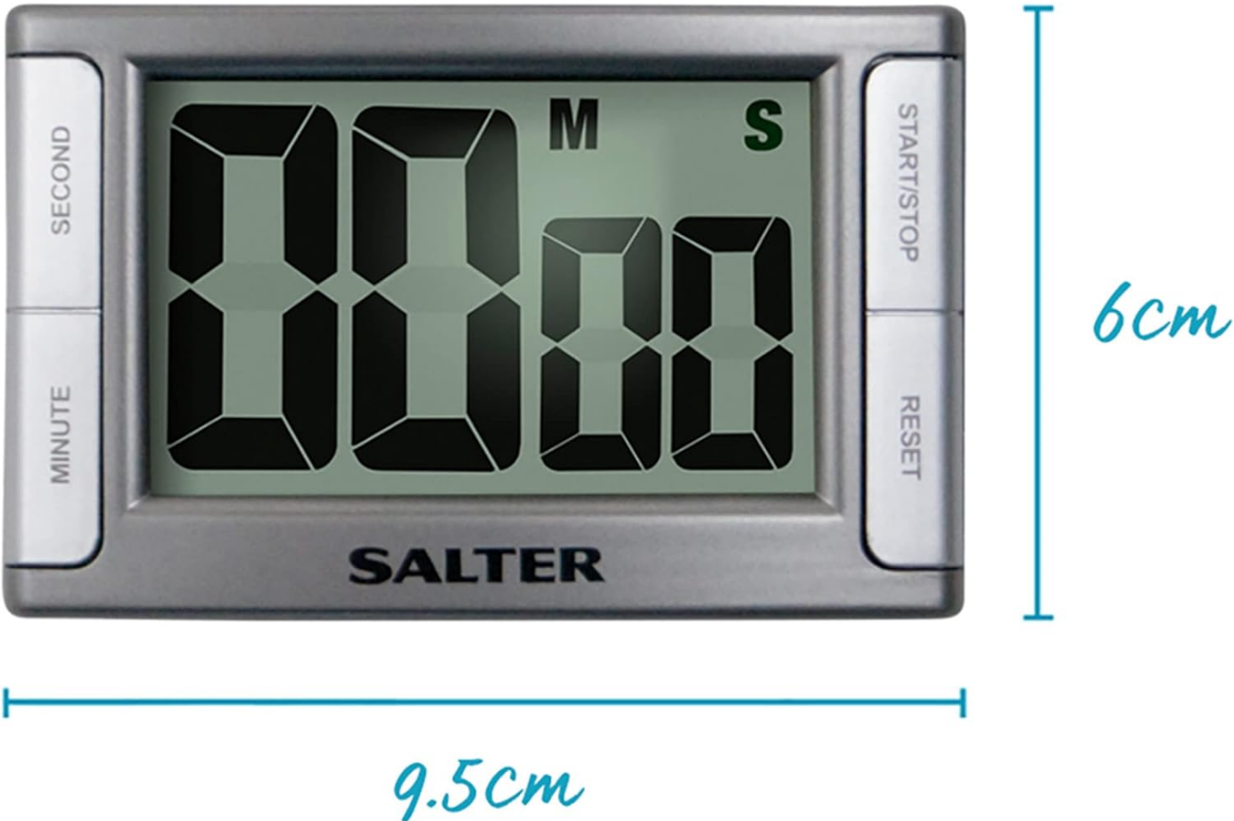
Image description: The Salter 396 SVXR digital kitchen timer is shown with its approximate dimensions indicated by arrows: 9.5 cm in length and 6 cm in height.

For warranty information or technical support, please refer to the contact details provided with your purchase or visit the