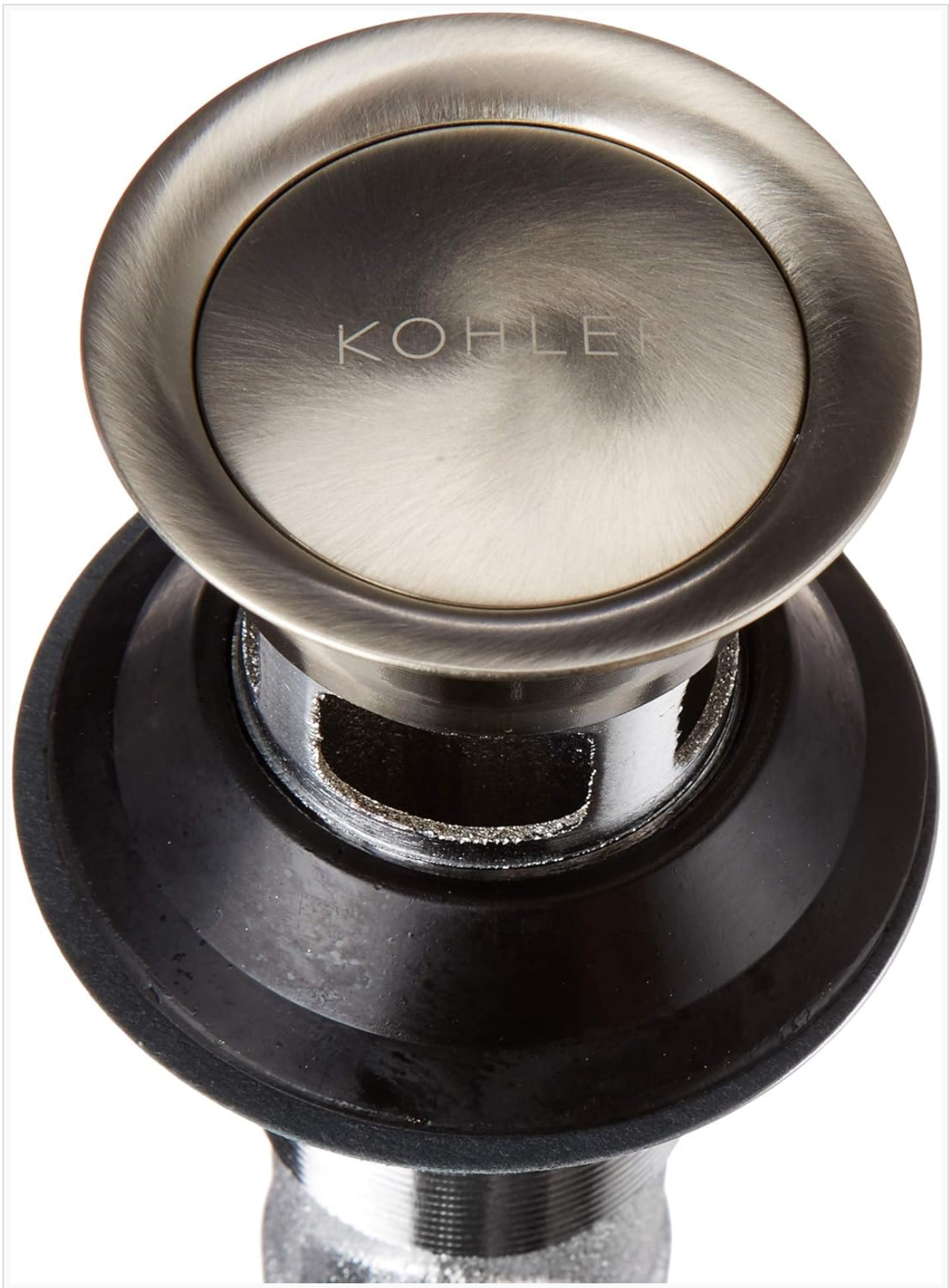
Image 4: Close-up view of the drain stopper in the Vibrant Brushed Nickel finish.