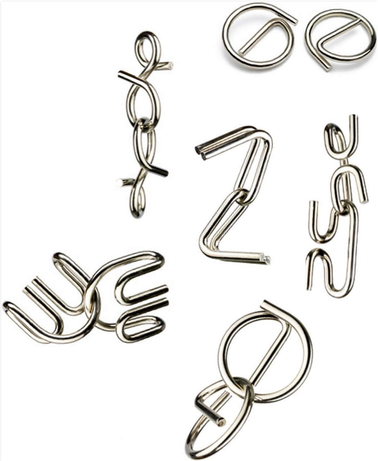
Image 2: A different perspective of the DJECO Casse Tête Crazix puzzle pieces, some appearing partially interlocked, demonstrating the intricate nature of the puzzle's design.