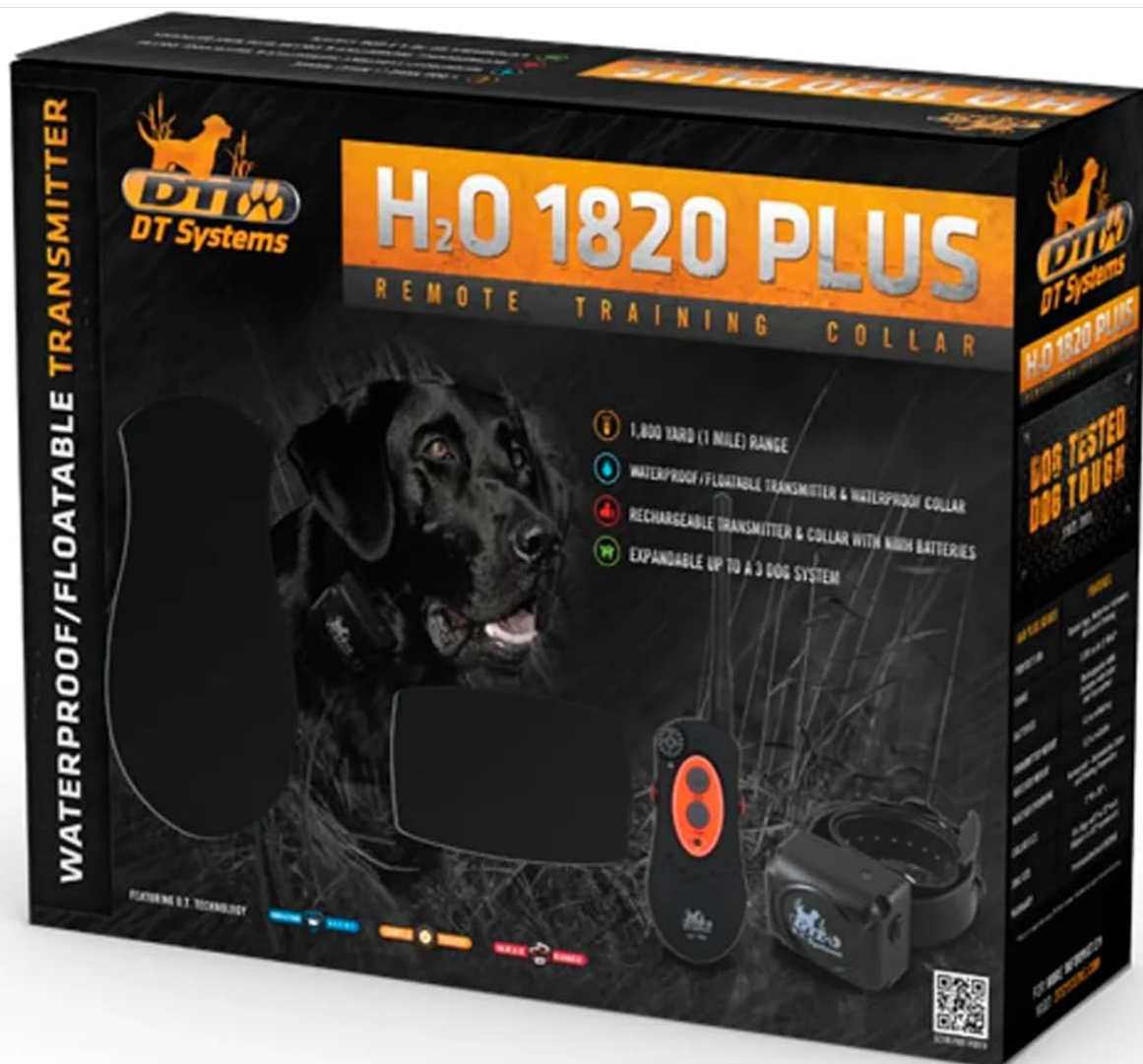
Image: The H2O1820 Plus product box, displaying the remote transmitter, collar receiver, and various accessories included in the package.