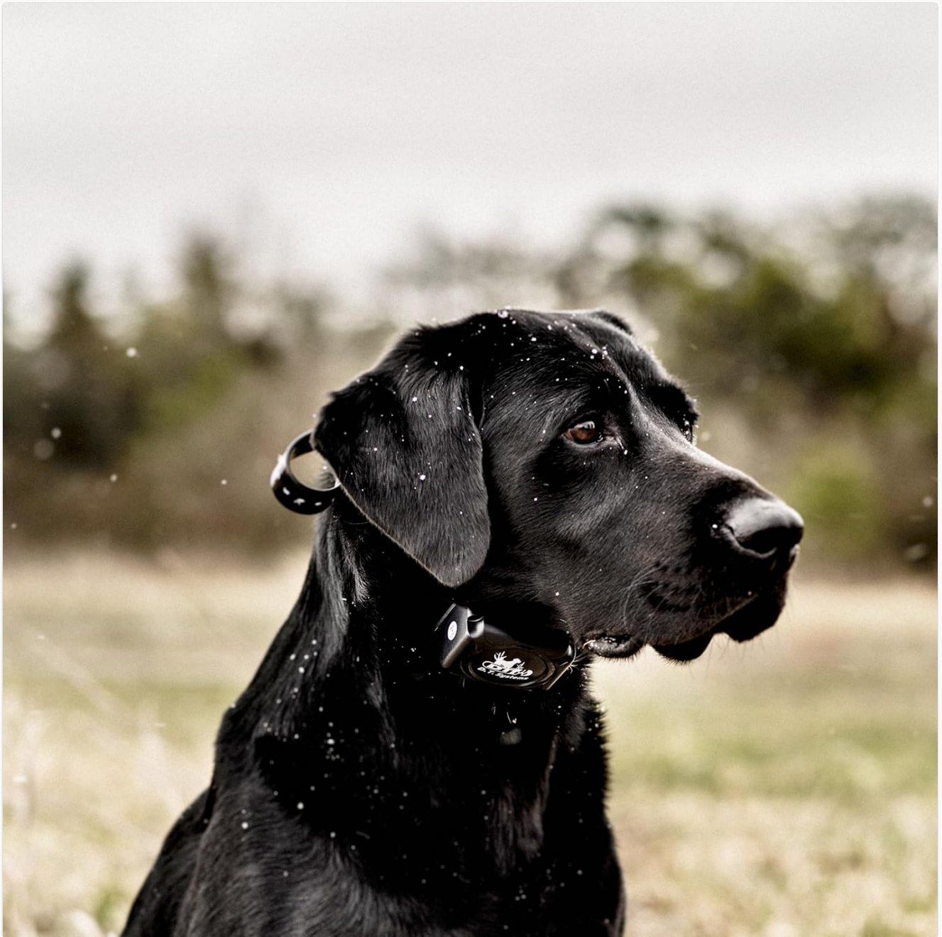
Image: A black Labrador Retriever wearing the collar receiver, demonstrating proper placement on the dog's neck.