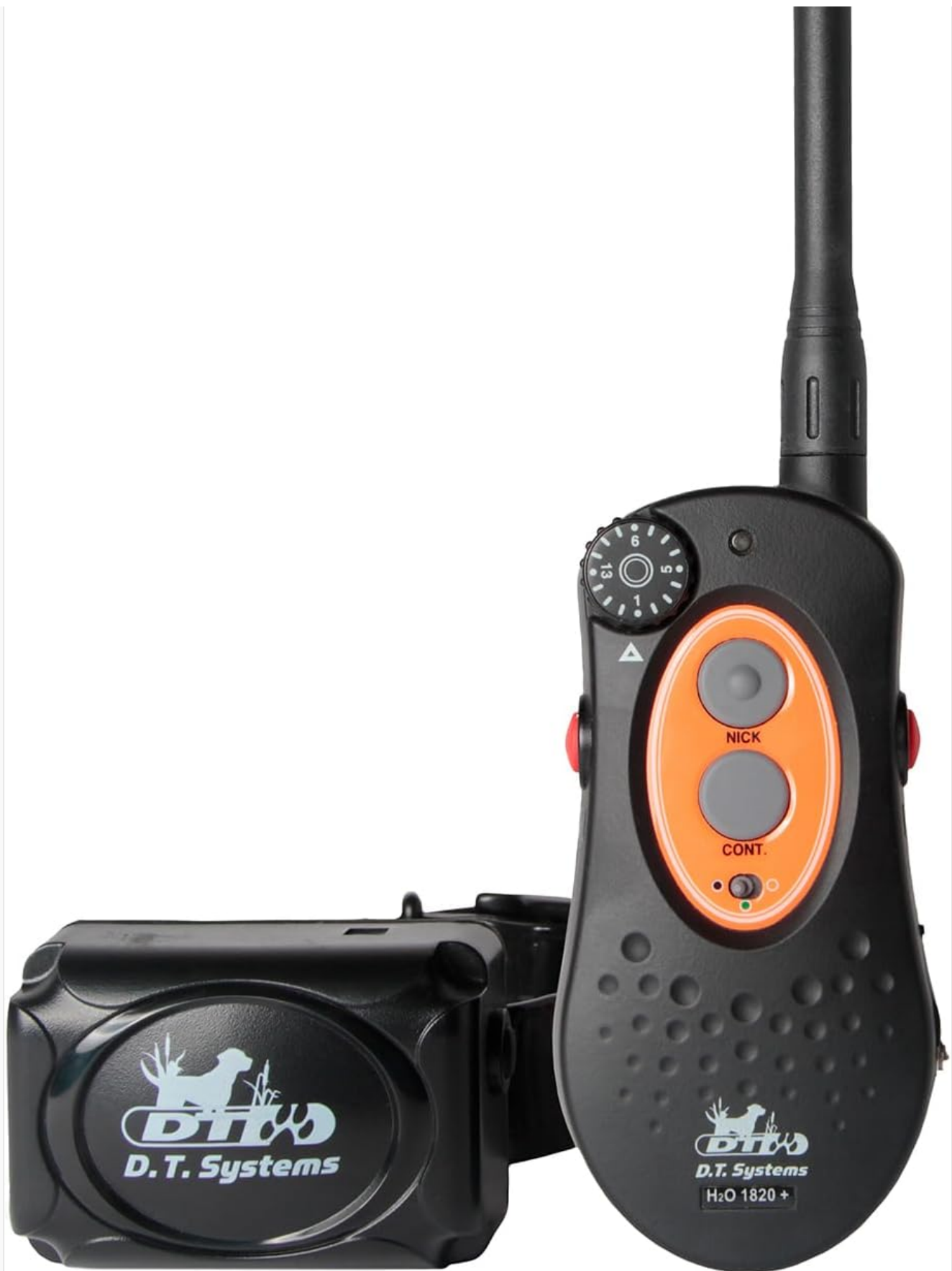
Image: The remote transmitter and collar receiver, illustrating the controls and components.