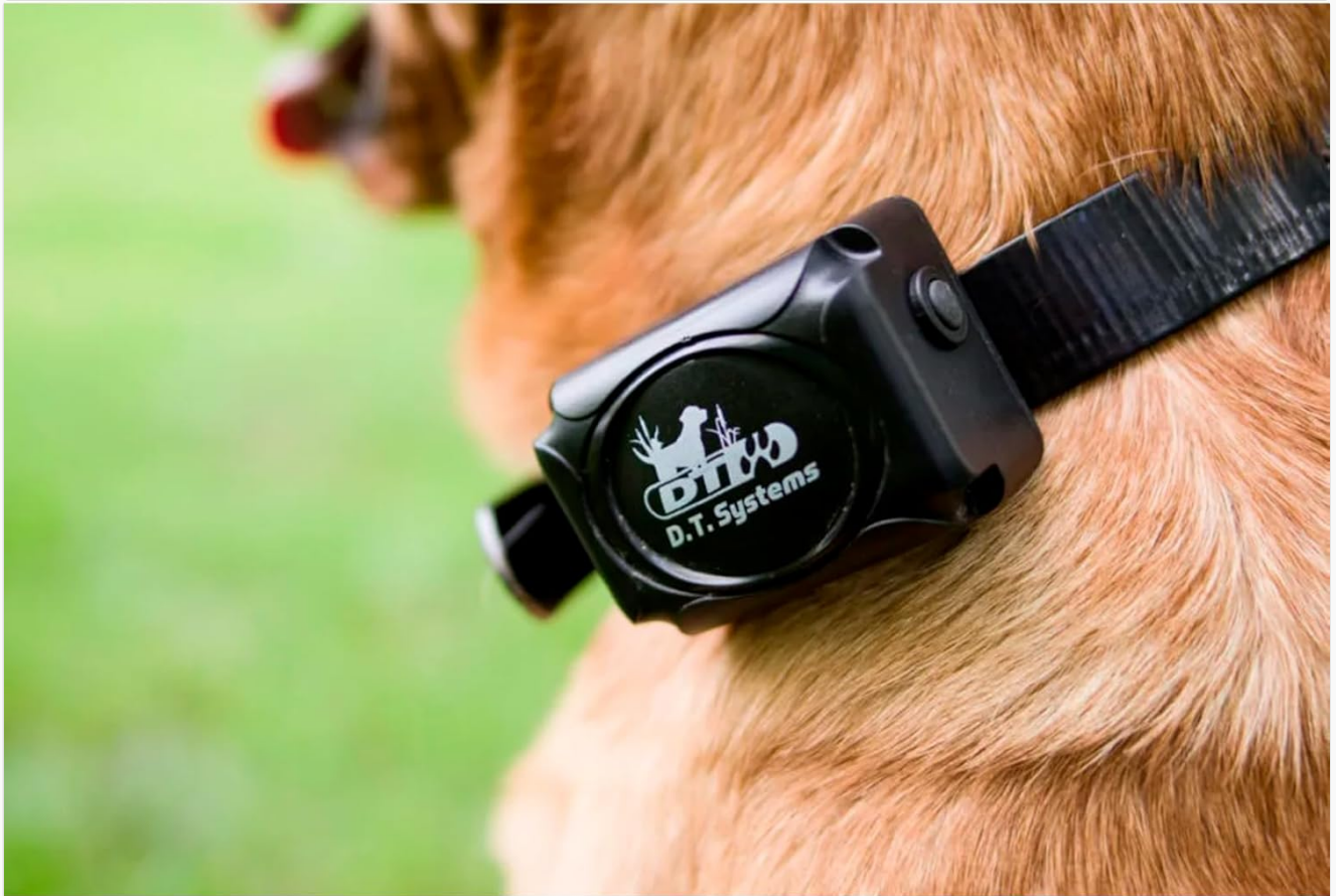
Image: Close-up of the collar receiver on a dog, highlighting the contact points against the fur.