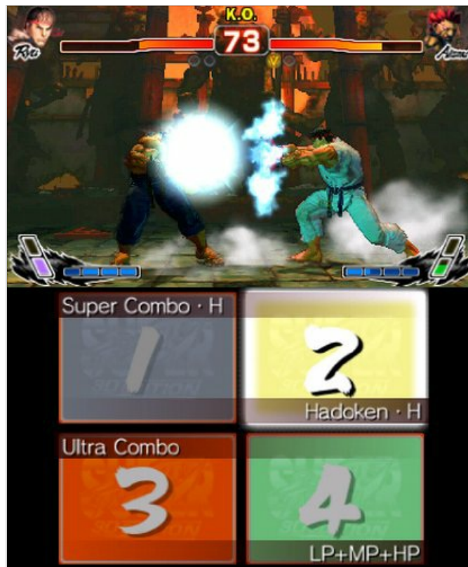
Image: Ryu performing a Hadoken, with the Nintendo 3DS bottom screen displaying touch-based controls for special moves.