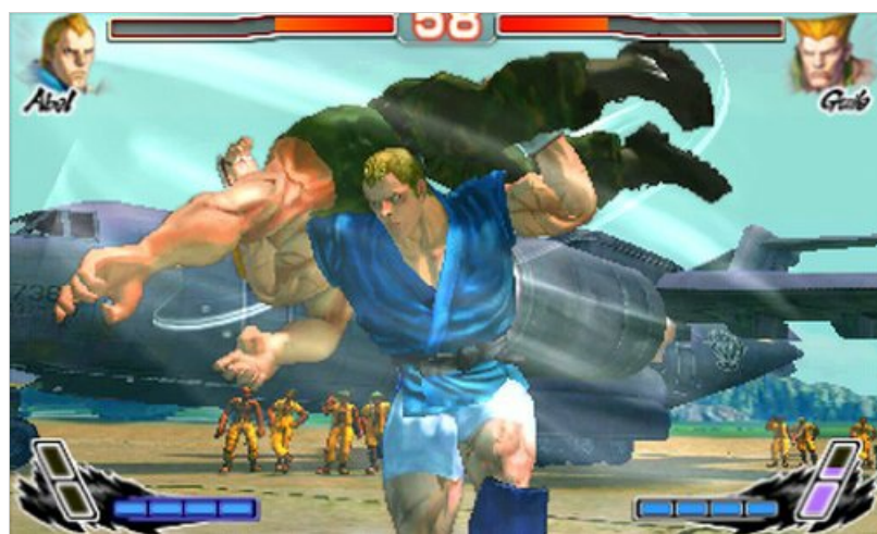
Image: Abel executing a grapple move on Guile, showing a close-up of character models during a special attack.