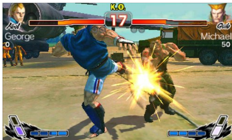
Image: Abel delivering a kick to Guile in an airfield environment, highlighting character interactions and stage details.