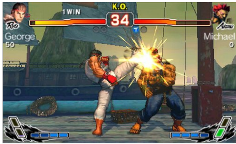
Image: Ryu executing a powerful kick against an opponent in a vibrant harbor setting, showcasing in-game combat.