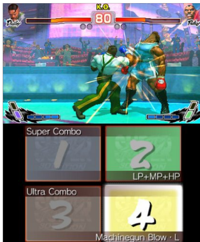
Image: Dudley executing a Machingun Blow, showing the touch screen interface for simplified move inputs.