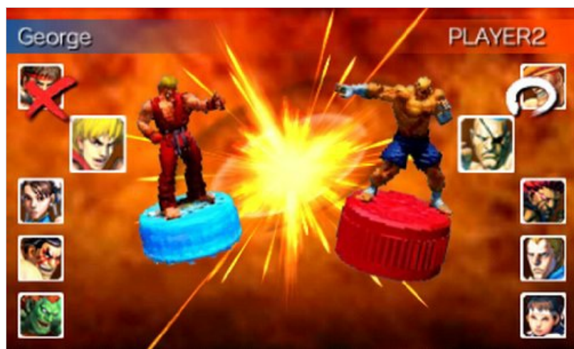
Image: A representation of the Figurine Mode battle, where two character figurines are poised for combat on their respective pedestals.