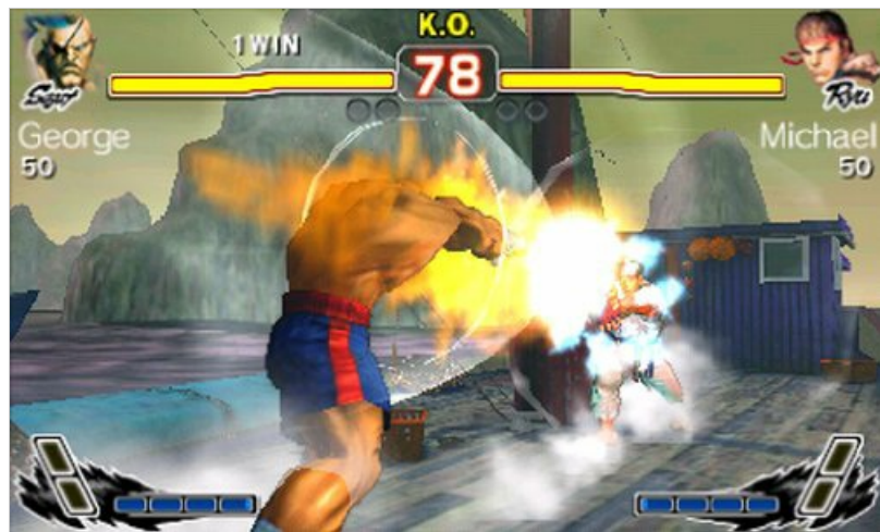
Image: A character landing a fiery punch on an opponent, illustrating the dynamic special effects during combat.