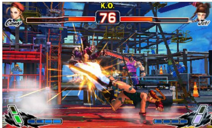
Image: Cammy performing an aerial attack on Juri in an industrial-themed stage, demonstrating character movement and attack variety.