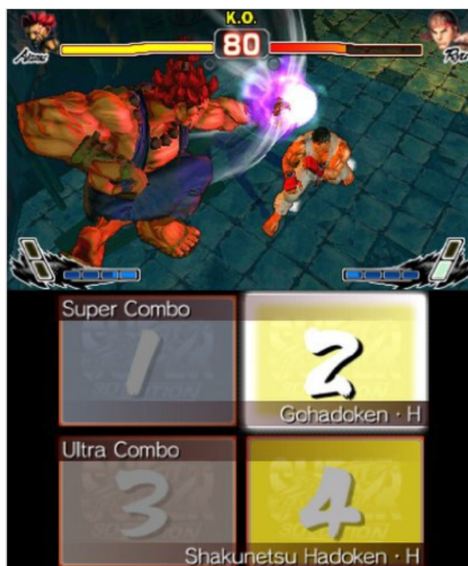
Image: Akuma unleashing a Gohadoken, with the Nintendo 3DS bottom screen showing touch controls for special attacks.