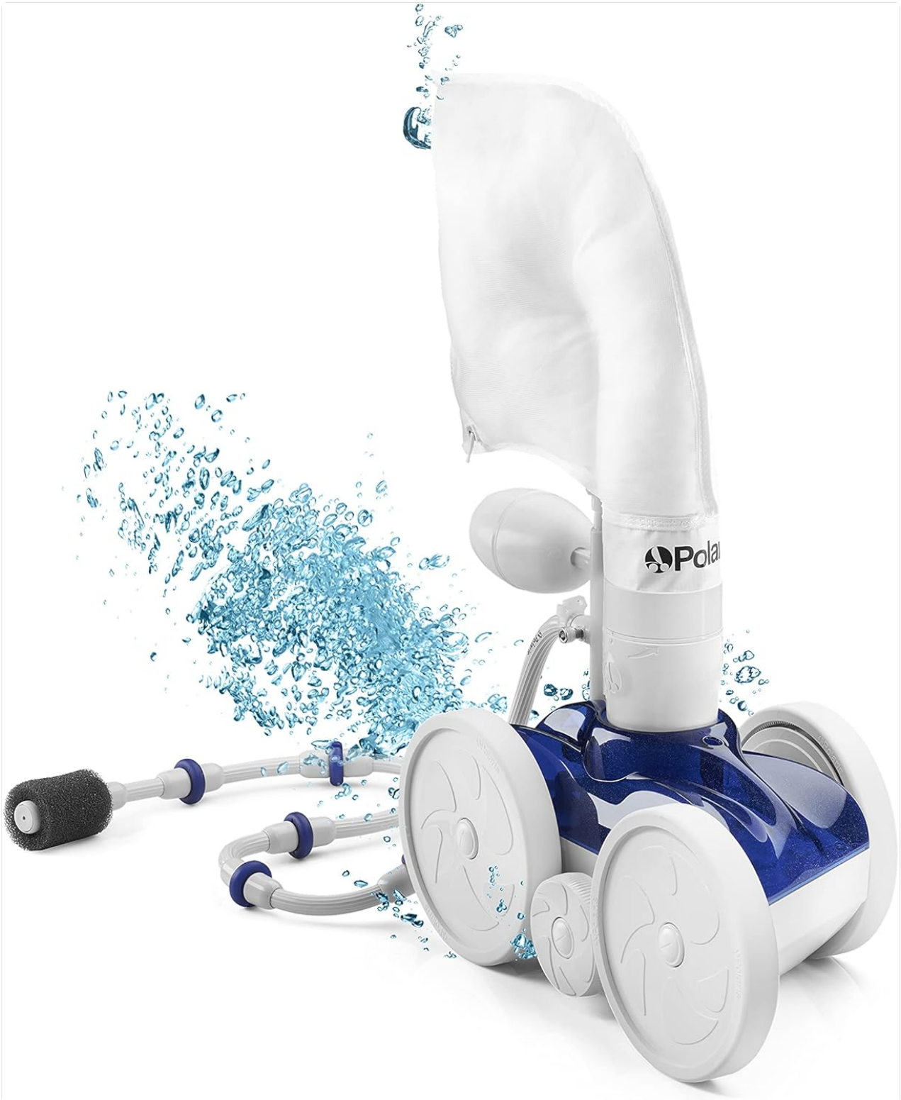
Figure 1: Main unit of the Polaris Vac-Sweep 280 Pool Cleaner.

Carefully remove all components from the packaging. Inspect all parts for any signs of damage. Ensure all listed items in the 'What's Included' section are present.