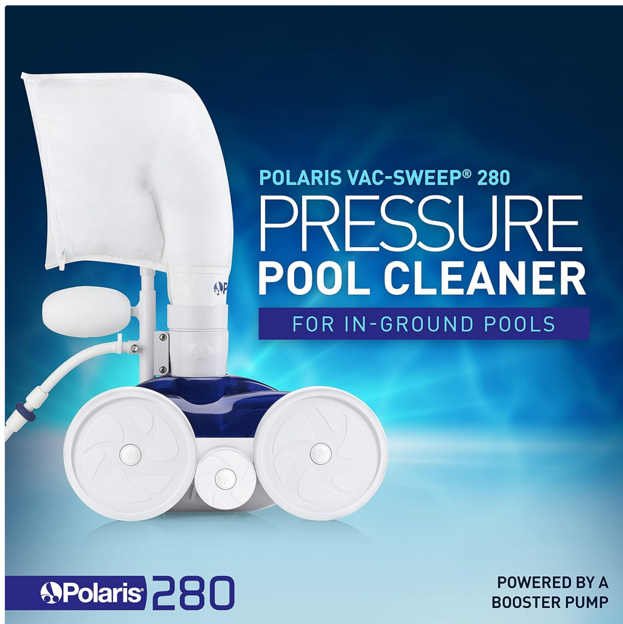
Figure 2: Front view of the cleaner with the hose attached.

The single chamber filter bag should be properly attached to the cleaner's intake.