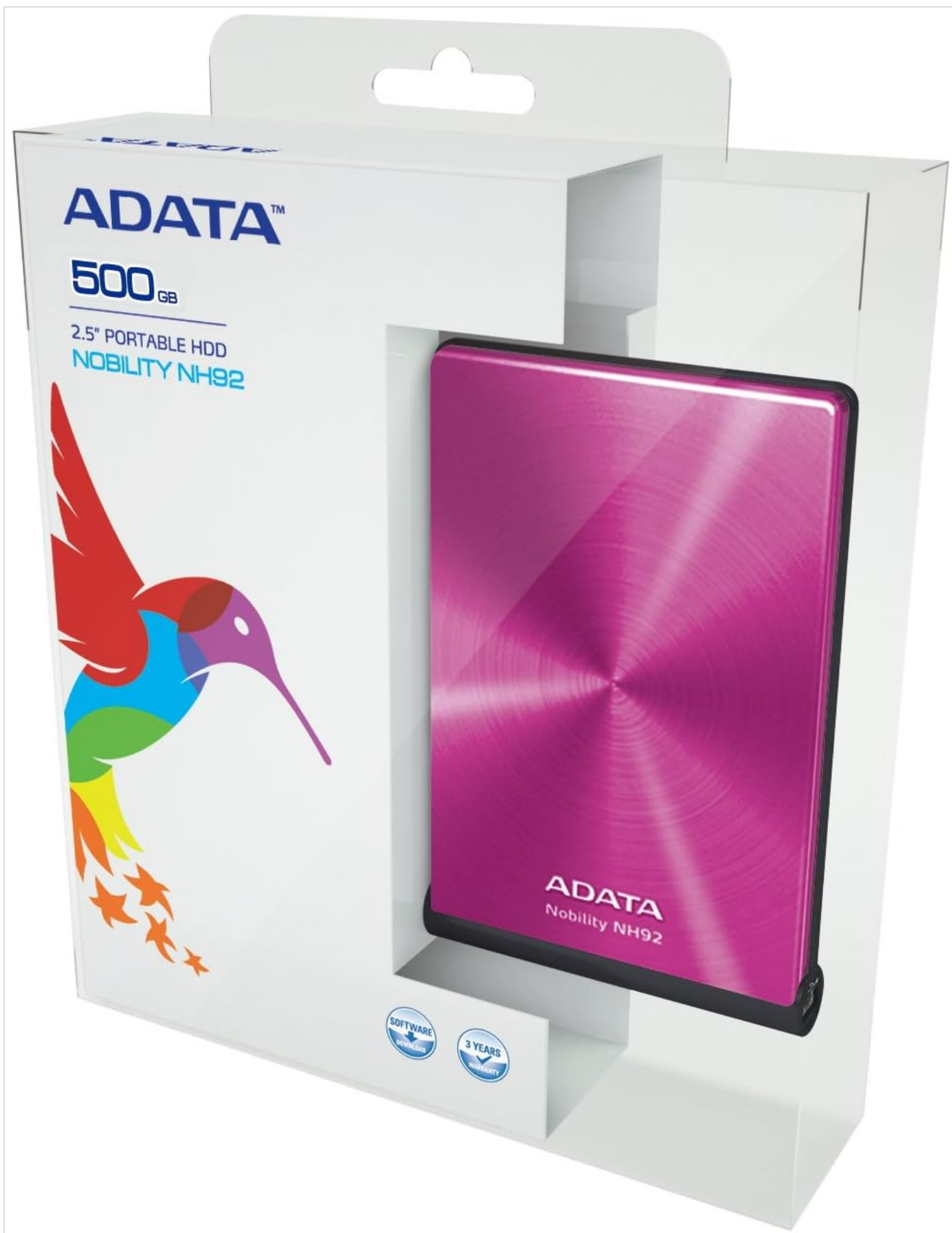
Figure 3.1: The ADATA NH92 500 GB External Hard Drive shown in its retail packaging, highlighting the drive and its capacity.