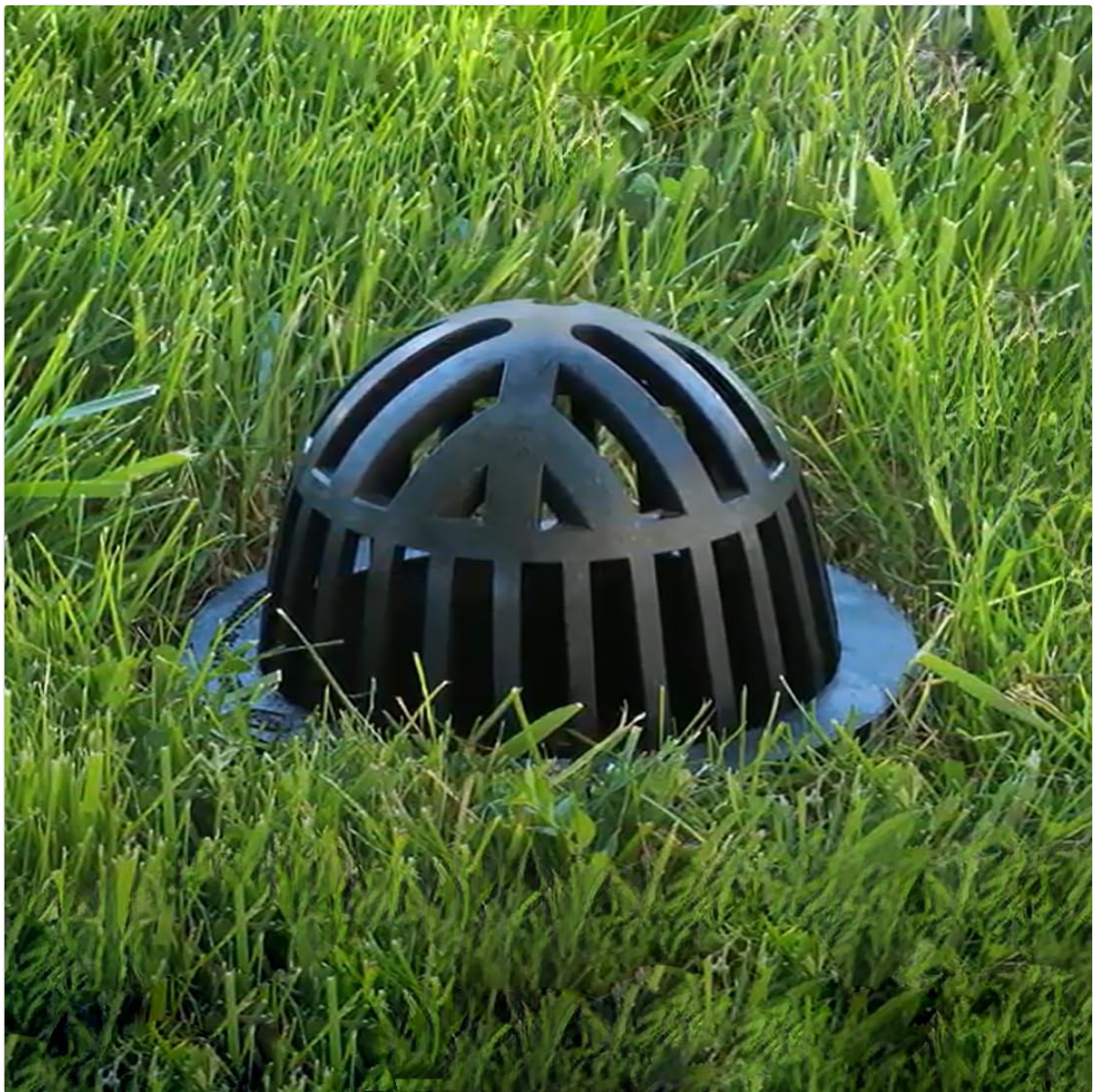
Figure 2: The atrium drain grate installed in a lawn, demonstrating its low-profile appearance and effective integration into landscaping.