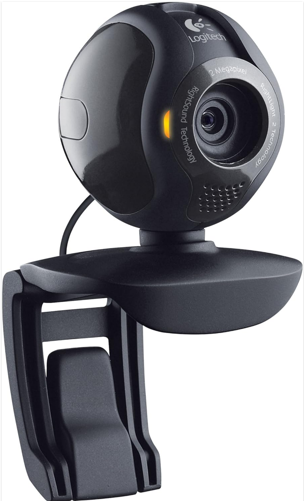
Image: Side view of the Logitech C600 HD Webcam, illustrating its adjustable clip for mounting on a monitor or standing on