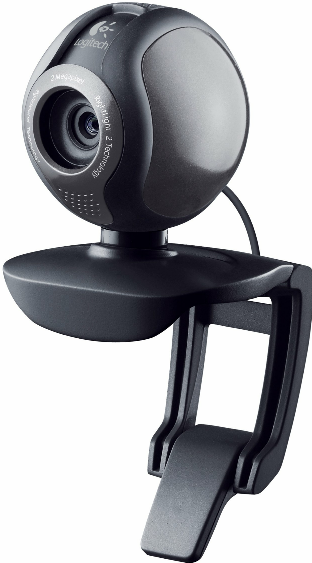
Image: Front view of the Logitech C600 HD Webcam, showcasing its spherical design and integrated stand.