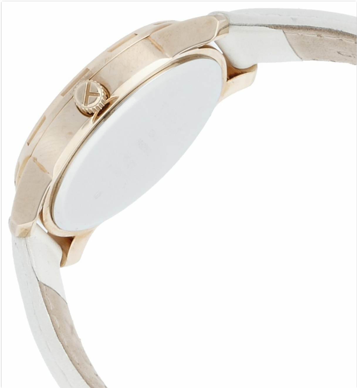
Image 2: Side view of the watch, highlighting the crown used for time adjustment.