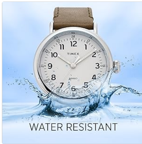
Image 4: Illustration detailing the water resistance capabilities of a watch, indicating suitability for swimming.