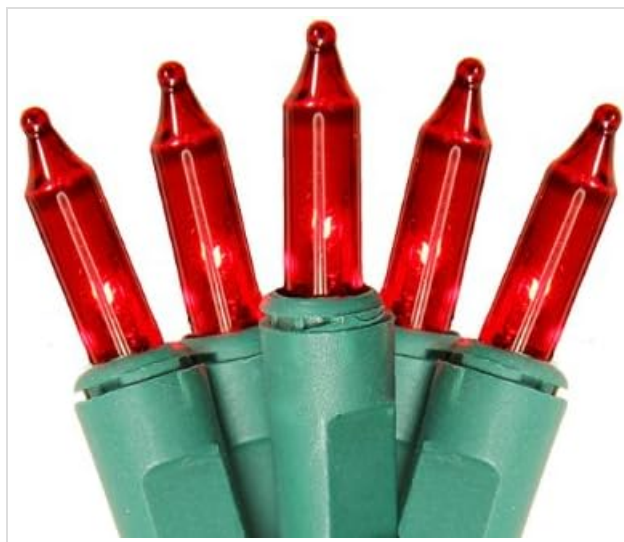
Figure 1: Close-up view of the red mini-bulbs and green wire.