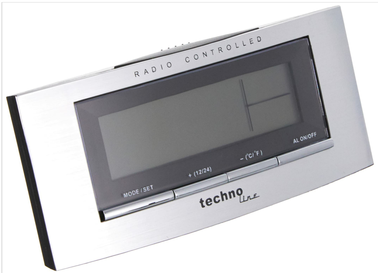
Figure 1: Front view of the Technoline WT 182 alarm clock, displaying the current time, date, day of the week, and indoor temperature. The 'RADIO CONTROLLED' text is visible at the top, and 'techno line' branding is at the bottom.