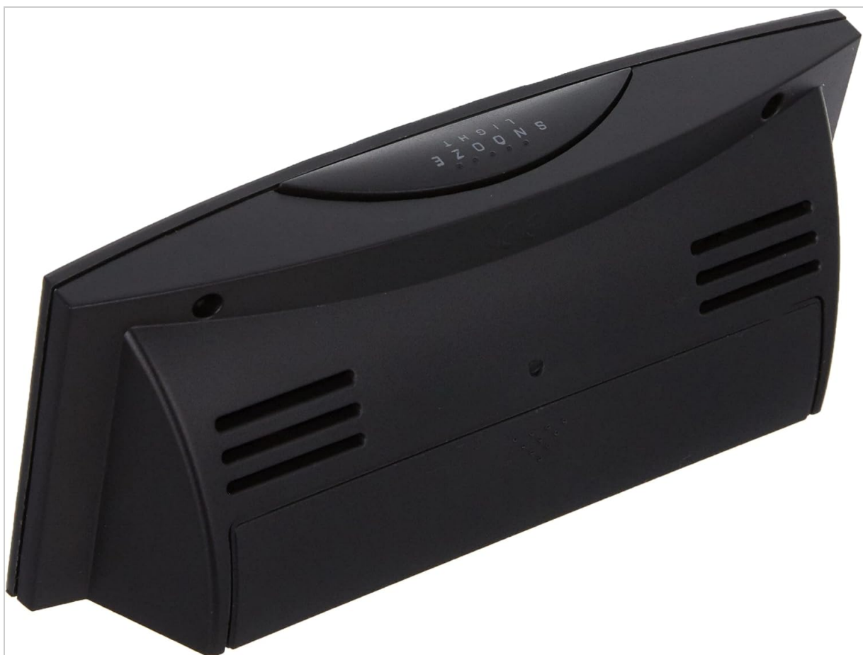
Figure 2: Top-side view of the alarm clock, highlighting the 'SNOOZE LIGHT' button located on the top edge of the device. This button is used to activate the backlight and the snooze function.