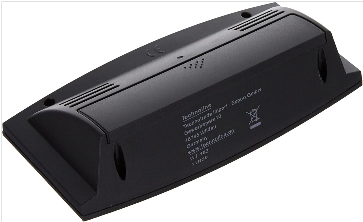
Figure 3: Rear view of the alarm clock, showing the battery compartment cover and the product information label. The label includes manufacturer details and the model number WT 182.