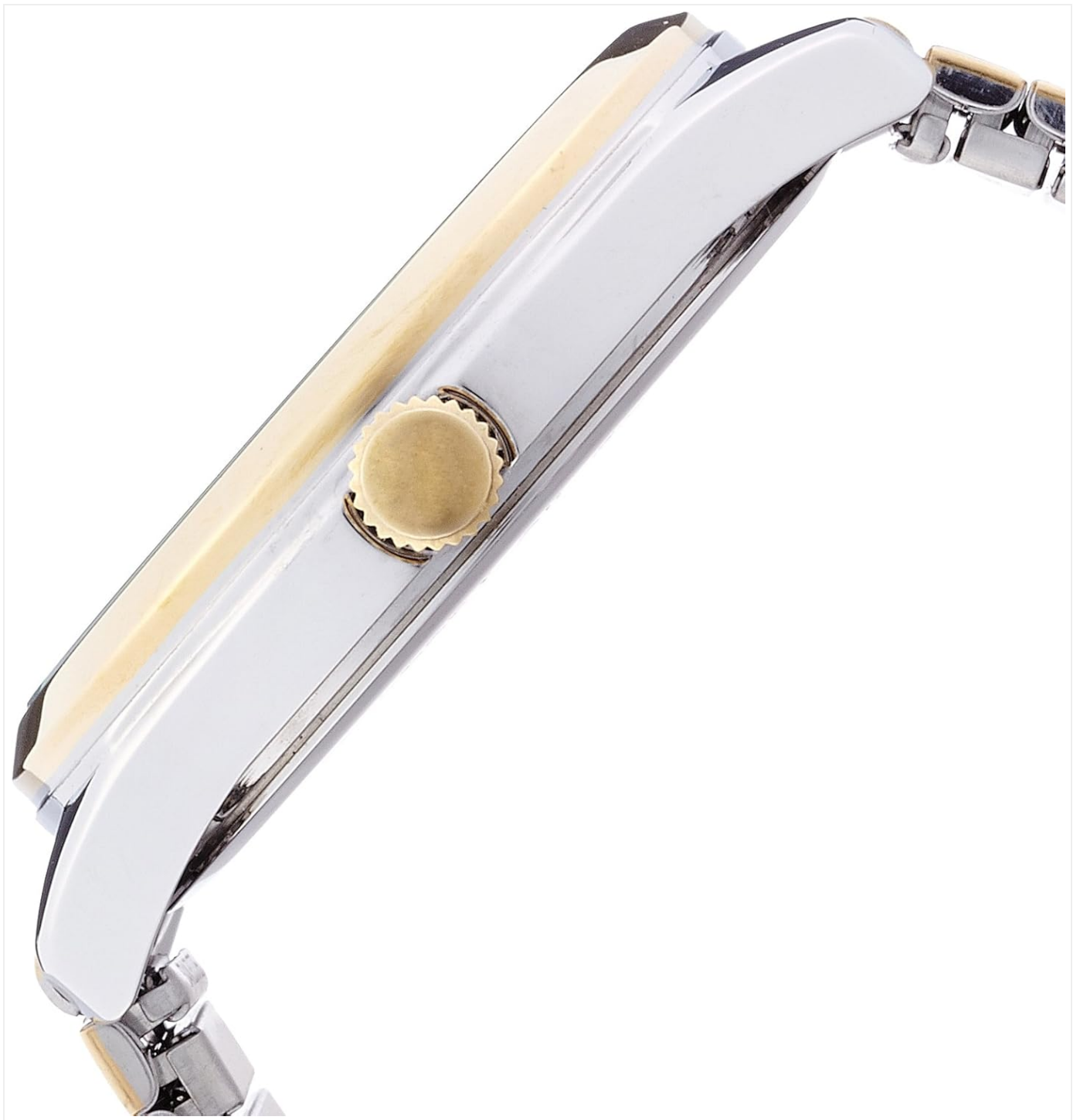
Side profile of the watch, highlighting the crown and the thickness of the watch case.