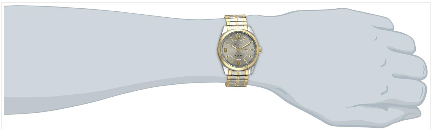
The Armitron watch displayed on a wrist, illustrating its fit and appearance during wear.