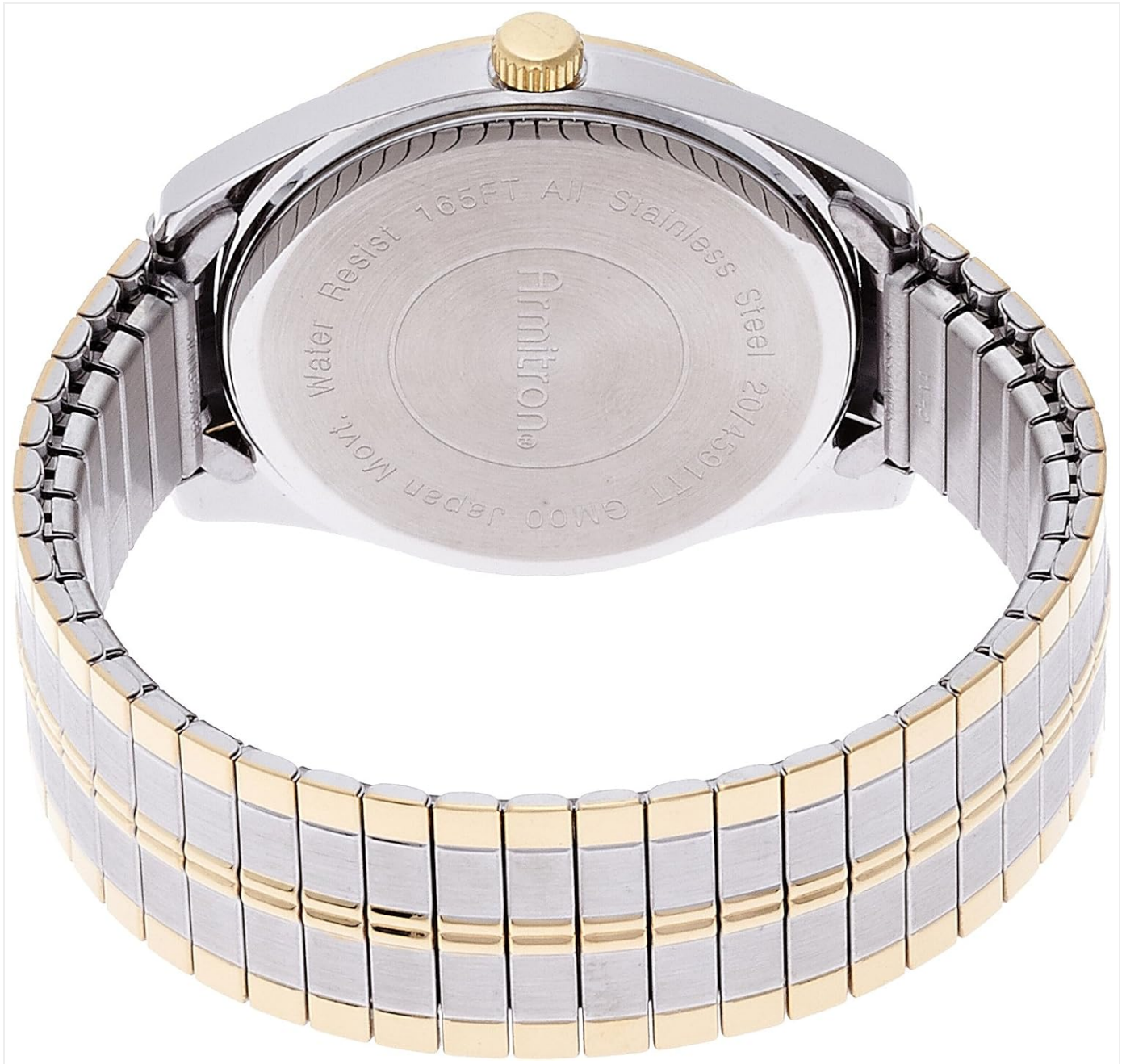
Rear view of the watch, showing the stainless steel case back and the expansion band from behind.