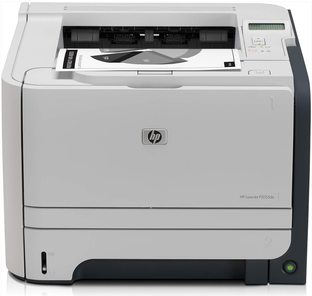
Figure 2: HP LaserJet P2055dn with paper loaded in the output tray, ready for printing.