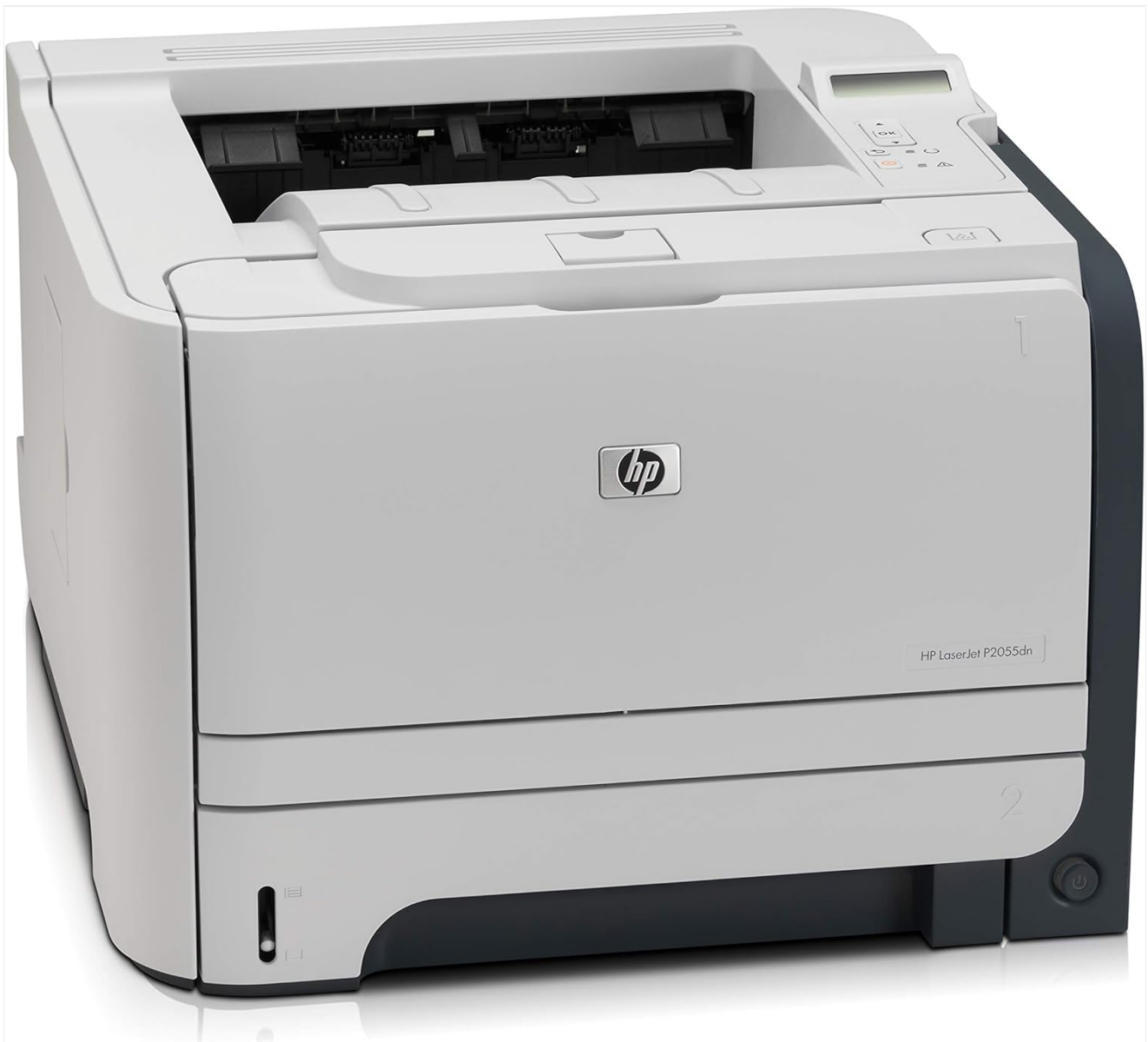
Figure 3: Angled view of the HP LaserJet P2055dn, highlighting the power button and control panel on the right side.