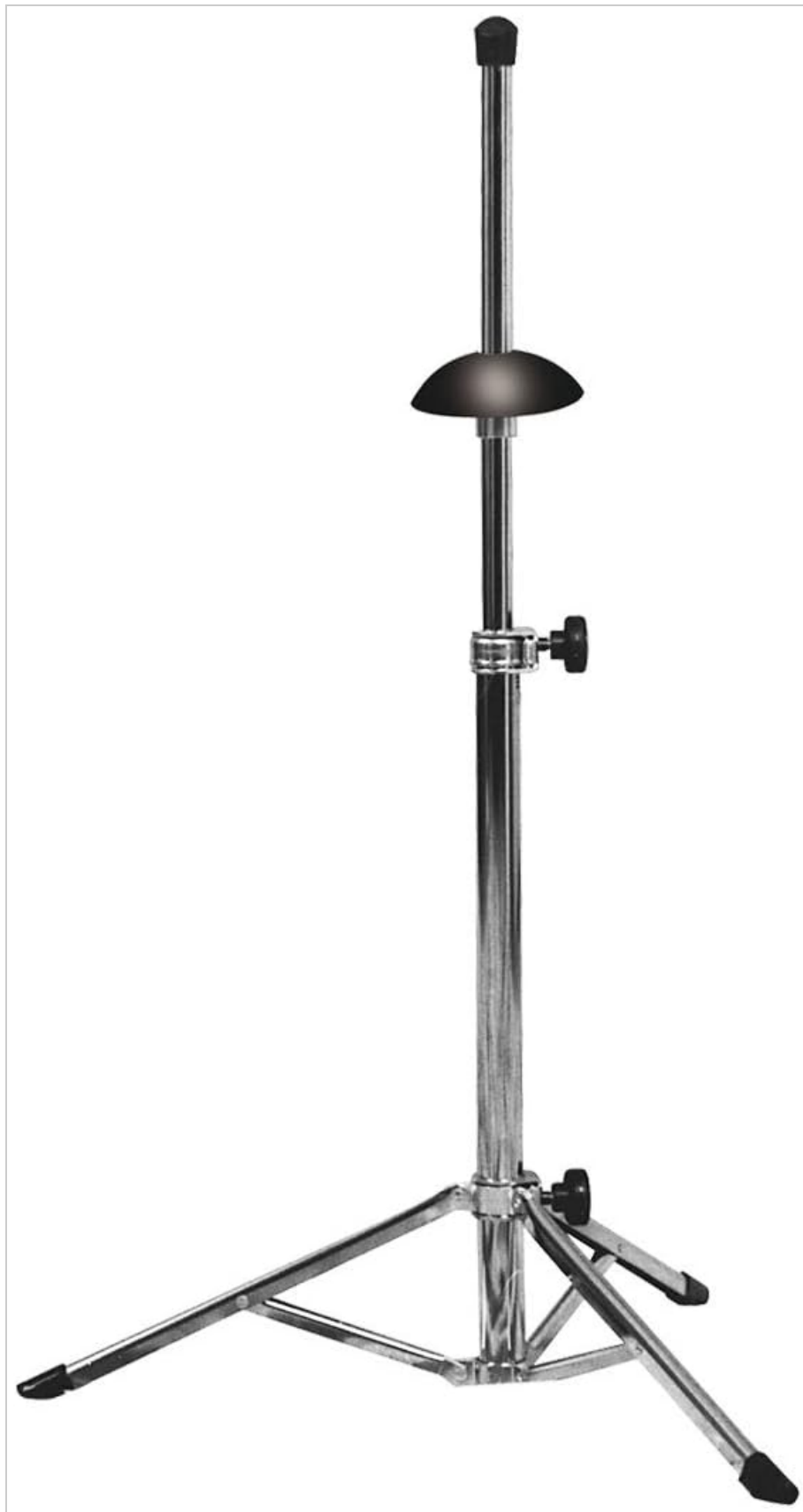
Image: The HamiltonBuhl KB510 Classic Trombone Stand, featuring a chrome finish, a rubber bell cup, and a stable tripod base.