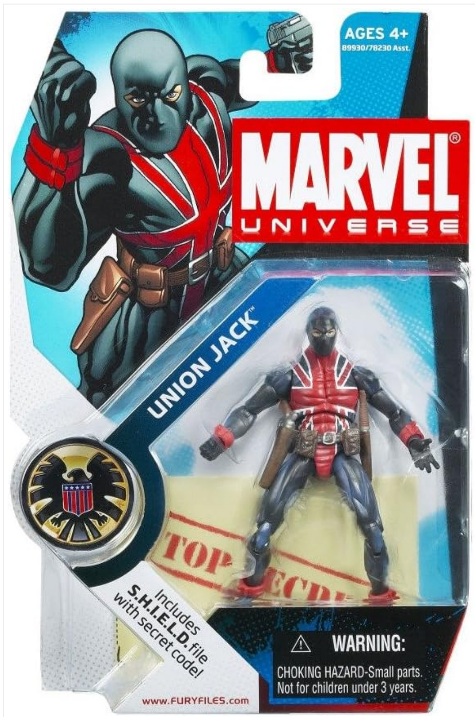
Image 1: Union Jack Action Figure in its original blister packaging, showing the character art and product details.