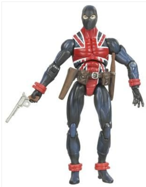
Image 2: Union Jack Action Figure out of packaging, holding a pistol and with a knife in a sheath on his belt. This image demonstrates the figure's articulation and accessories.