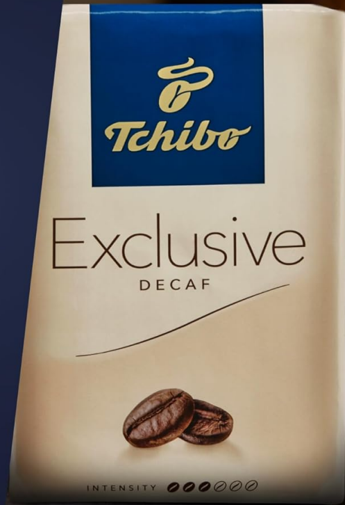
Image 1.1: Tchibo Exclusive Decaf Ground Coffee package, highlighting its decaffeinated nature and refined flavor.

Understanding the coffee's characteristics is key to enjoying its full potential. The Tchibo Exclusive Decaf features a specific intensity, acidity, and roasting level designed for a smooth and pleasant experience.