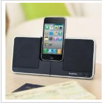
Image: The Brookstone iDesign Flip Speaker Dock with an iPhone device docked in the horizontal (landscape) position, demonstrating the flip feature.