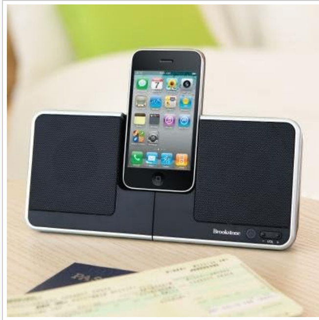
Image: A close-up view of the Brookstone iDesign Flip Speaker Dock with an iPhone securely docked in the upright, vertical position.