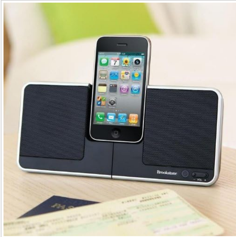
Image: The Brookstone iDesign Flip Speaker Dock with an iPhone device docked in the vertical position, showcasing its primary use.