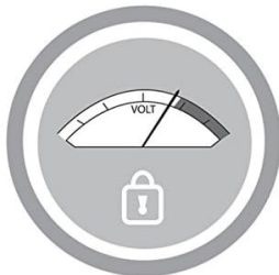
Überspannungsschutz Overvoltage protection