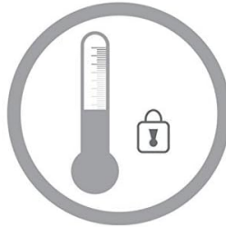
Temperaturschutz Overheat protection