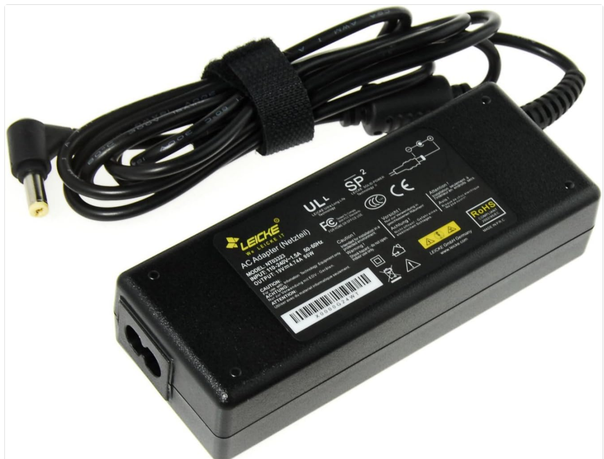
Image: A detailed view of the L-shaped DC connector tip, which plugs into the laptop's power port.