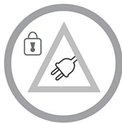
Kurzschlusschutz Short circuit protection