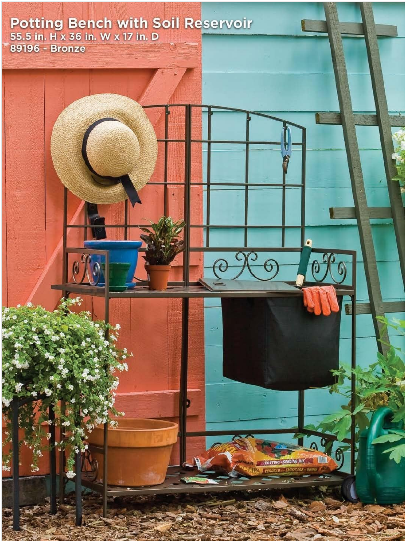
Image 2: The potting bench set up in a garden, demonstrating its use for planting activities and storage.