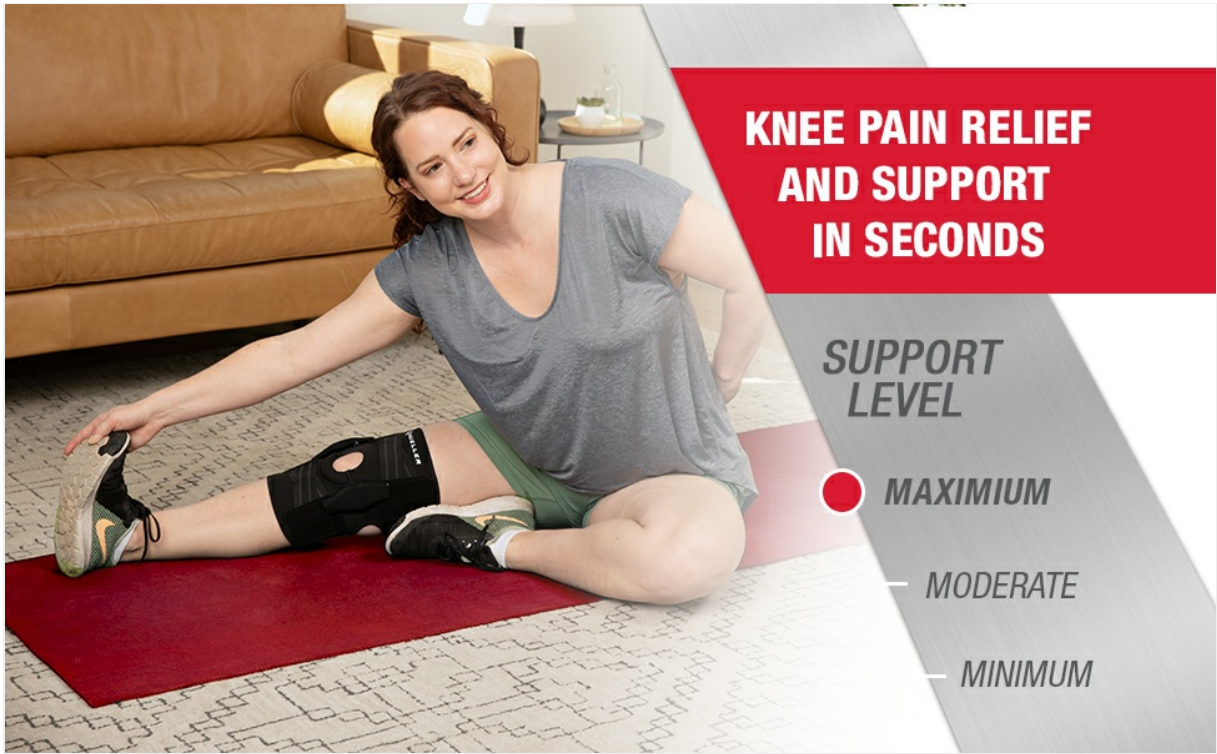
Image 3.1: The brace provides support during physical activity, targeting knee pain.