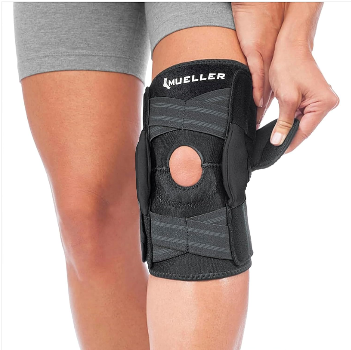
Image 1.1: Front view of the MUELLER Self-Adjusting Hinged Knee Brace.