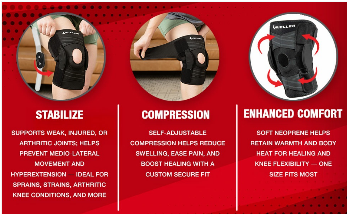
Image 2.3: Diagram illustrating the self-adjusting design and key components of the knee brace.