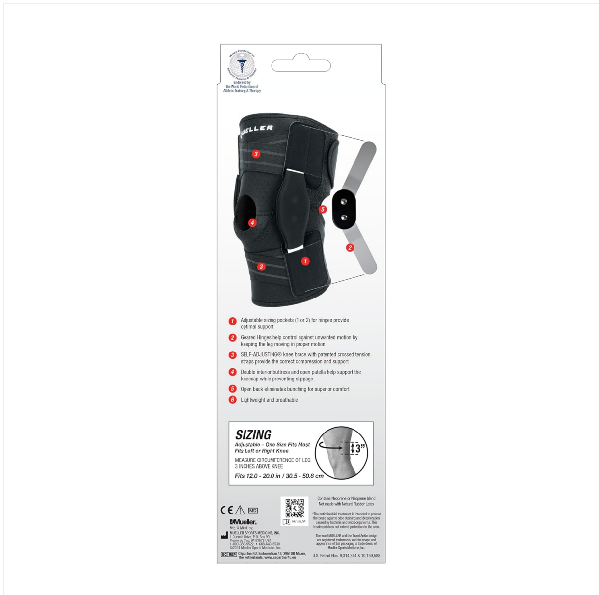
Image 6.1: Packaging detail showing product features and sizing guide.