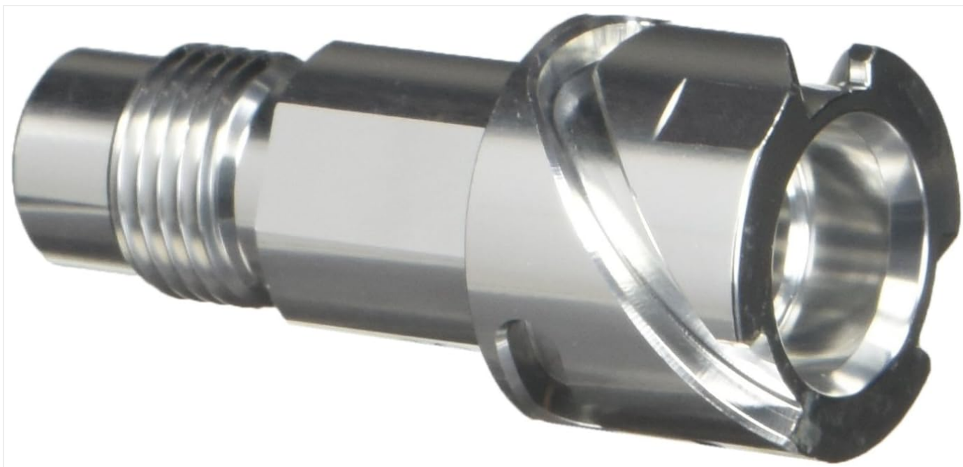
Figure 1: Side view of the DeVilbiss DPC10 DeKups Adapter. The threaded end connects to the spray gun, while the wider end is designed for the DeKups system.