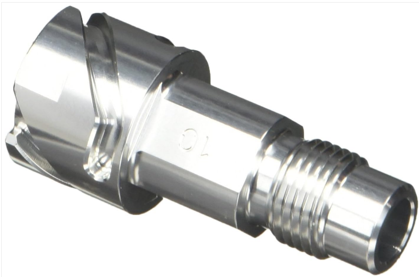
Figure 2: Angled view of the DeVilbiss DPC10 DeKups Adapter, showing the "10" marking on its body, indicating the model number.