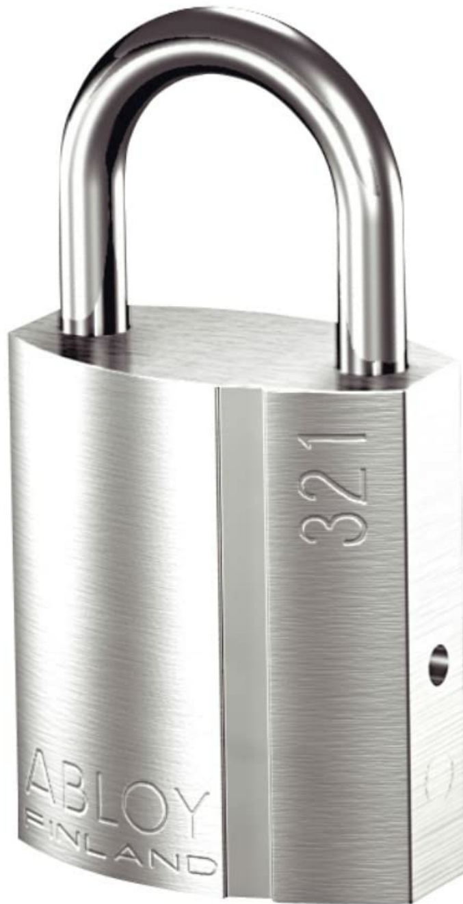
Image 1.1: Abloy Protec2 PL 321 Padlock. This image displays the padlock from a front-side angle, showing its brass body and stainless steel shackle. The Abloy logo is visible on the front, and the model number '321' is etched on the side of the body.