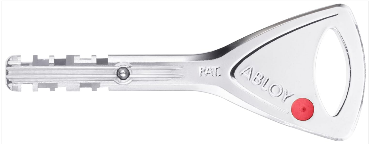
Image 2.1: Abloy Protec2 Key. This image shows the unique design of the Abloy Protec2 key, characterized by its flat, symmetrical blade with multiple disc-like cuts and a distinctive red dot on the key bow, indicating the Protec2 system.

The Abloy Protec2 PL 321 Padlock is ready for use directly out of the packaging. No assembly is required. Familiarize yourself with the key and the keyway before initial operation.