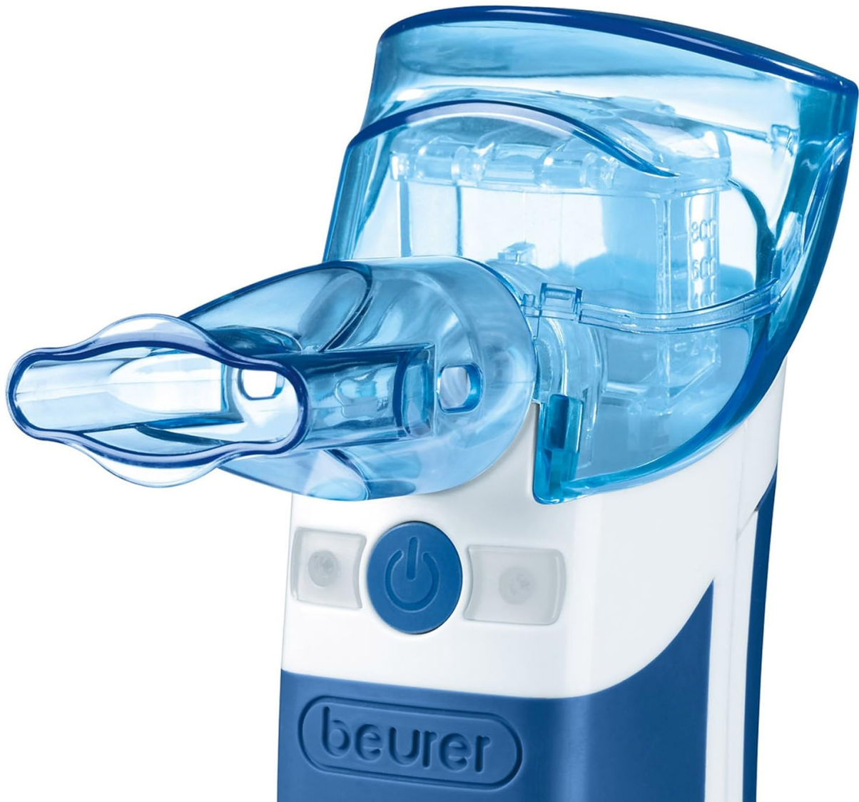
Image 8.1: Visual representation of the IH 50's core features and components.