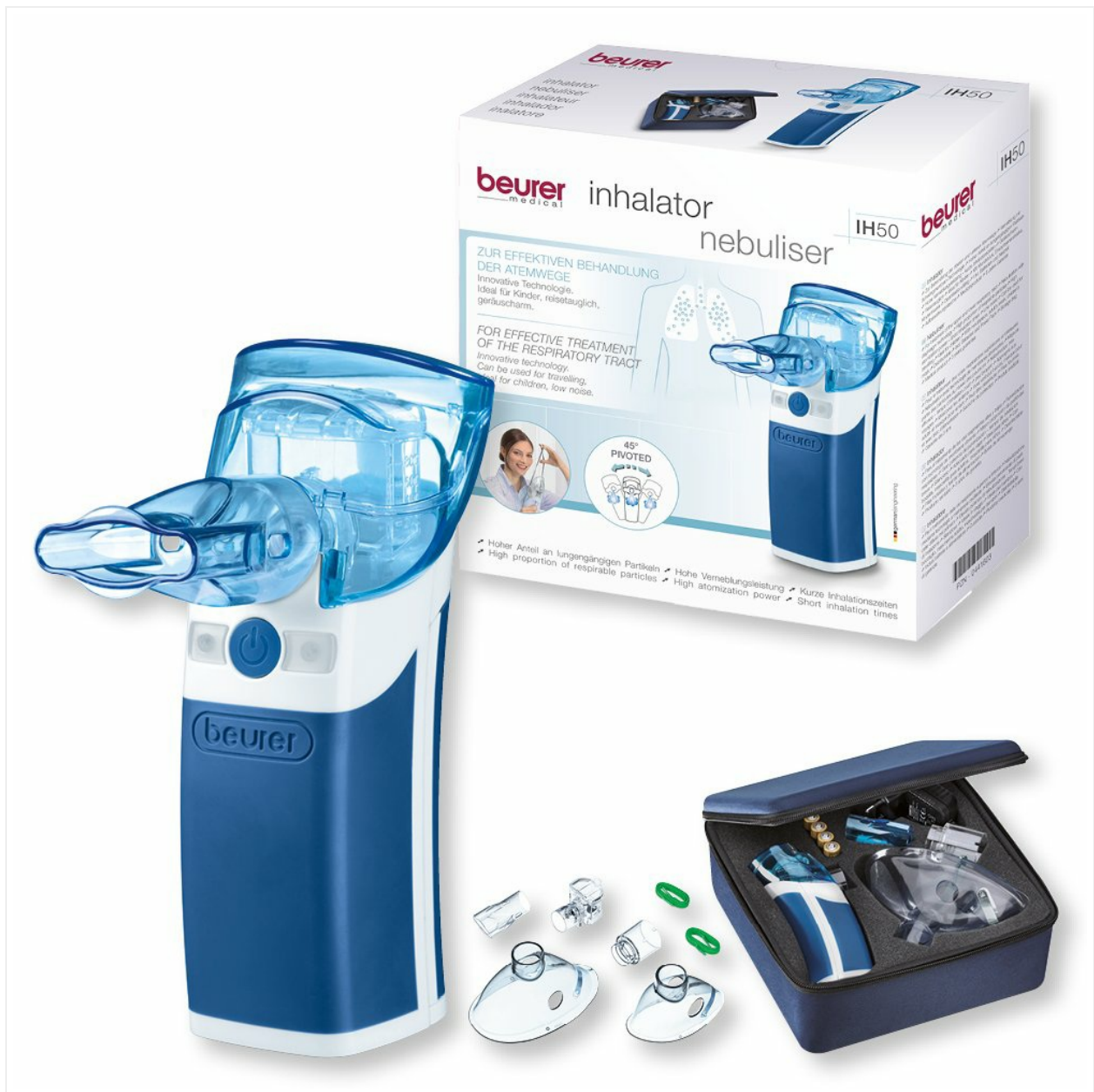
Image 1.1: The Beurer IH 50 Nebulizer, its retail packaging, and the included carrying case.