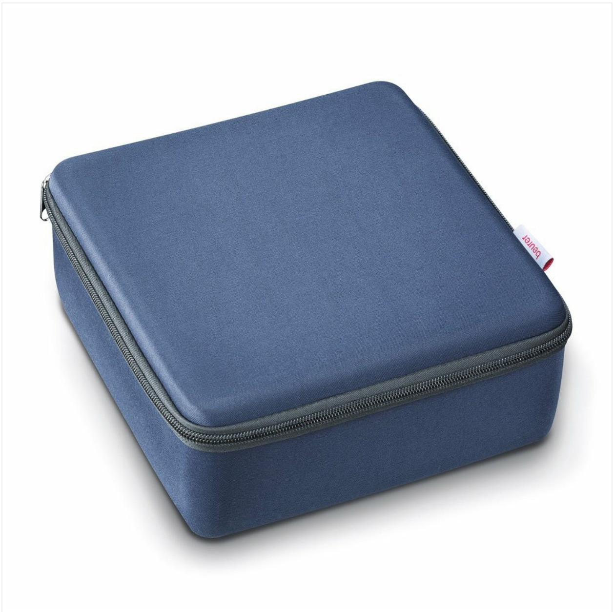
Image 6.2: The closed carrying case, highlighting the portability of the Beurer IH 50 Nebulizer.