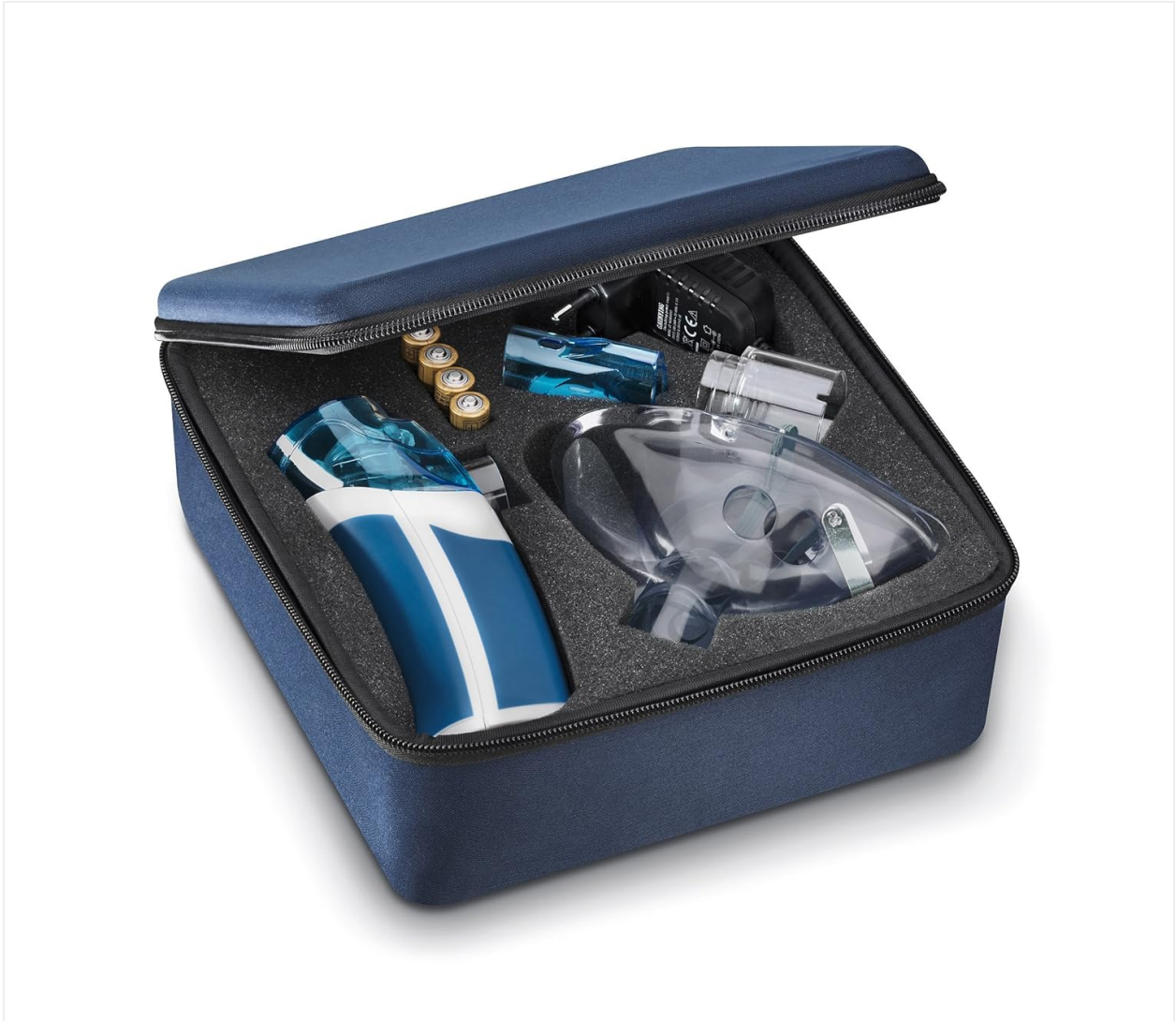
Image 6.1: The nebulizer and its components organized within the compact carrying case for storage or travel.

Store the clean and dry nebulizer and its accessories in the provided storage box in a cool, dry place, away from direct sunlight and extreme temperatures.