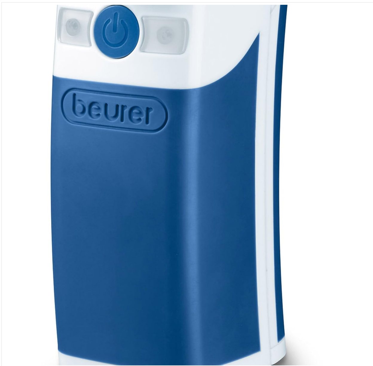
Image 4.1: The nebulizer unit with the mouthpiece attached, ready for use.