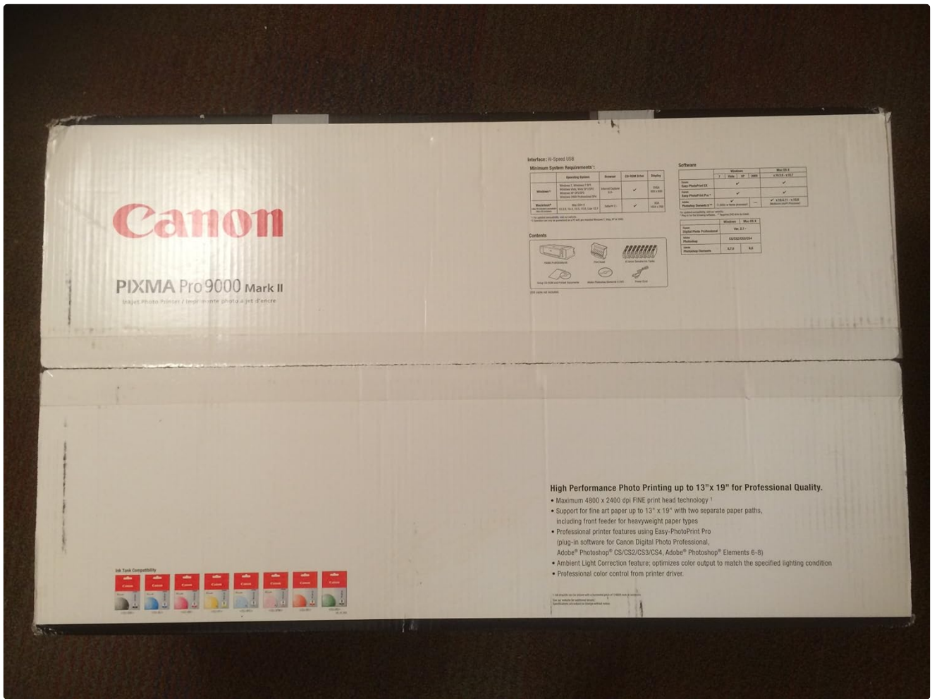
Image: Front view of the Canon PIXMA Pro9000 Mark II printer box, showing the product image and branding.