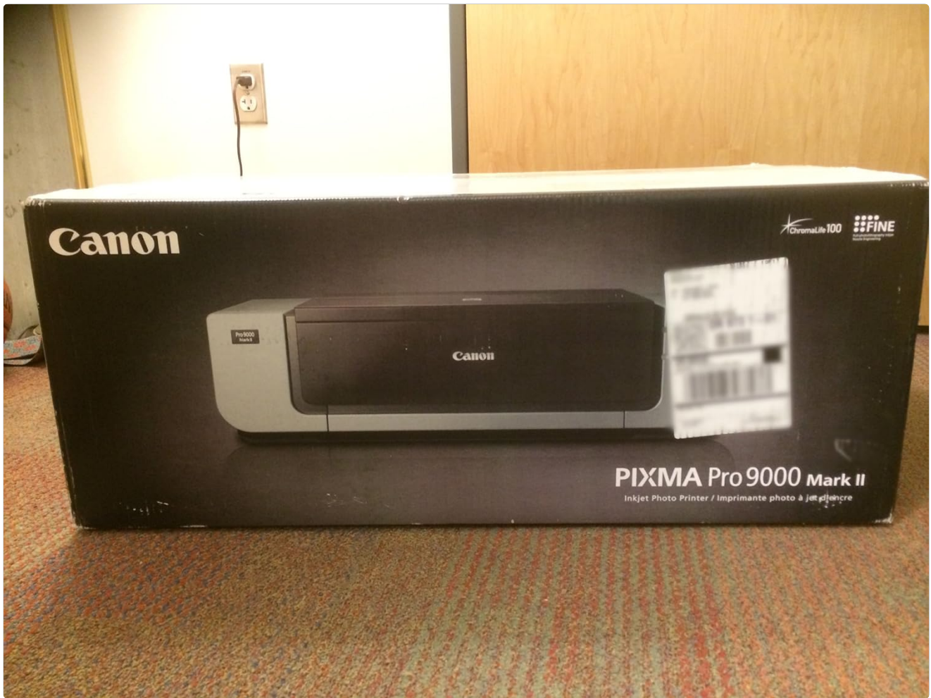
Image: The Canon PIXMA Pro9000 Mark II Inkjet Photo Printer, showcasing its design.