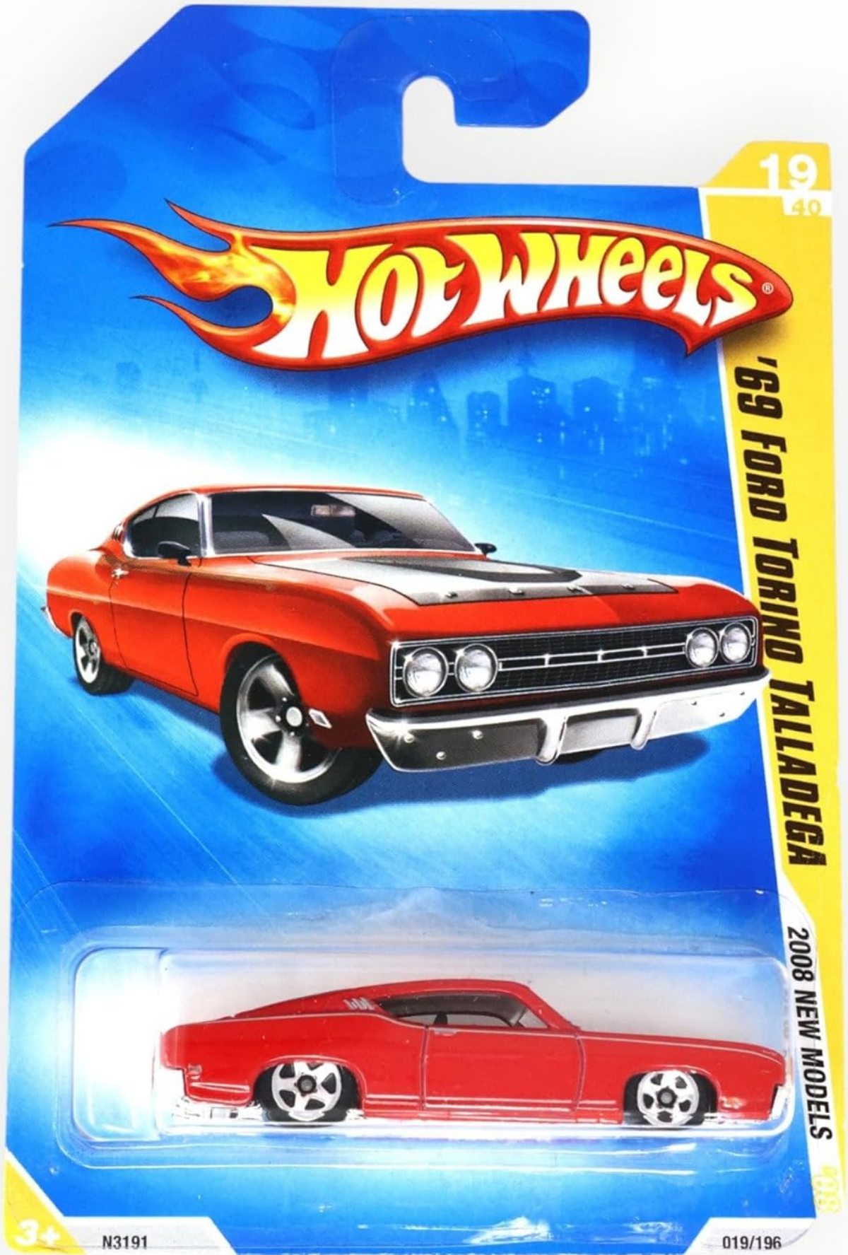
Image: A front-side view of the Hot Wheels '69 Ford Torino Talladega die-cast car, showcasing its red paint, black hood, and detailed wheels.