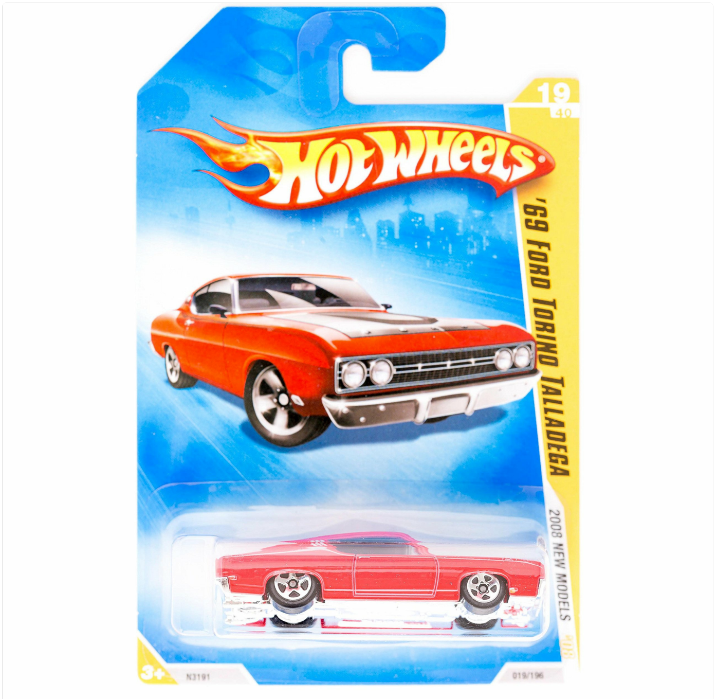
Image: The Hot Wheels '69 Ford Torino Talladega die-cast car displayed within its original blister packaging, showing the car and the Hot Wheels branding.