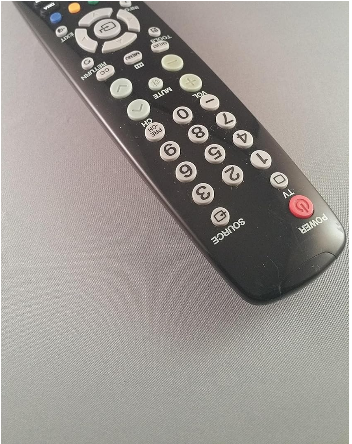
Image: Front view of the Samsung BN59-00678A remote control, displaying its array of buttons for various TV functions.