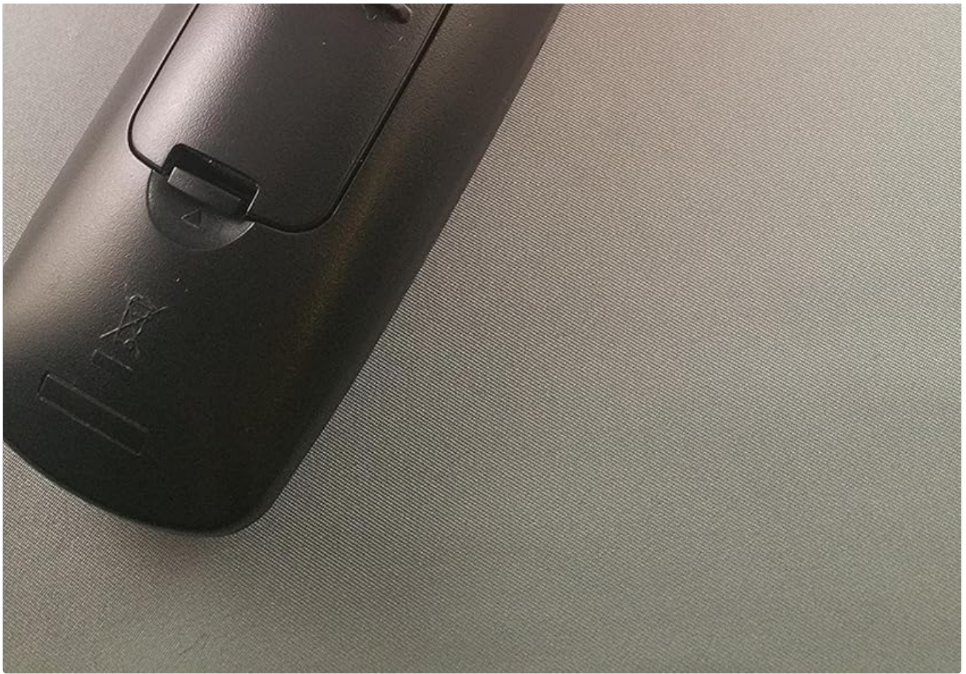
Image: Rear view of the Samsung BN59-00678A remote control, showing the battery compartment. The cover is partially open, revealing the slots for two AAA batteries.