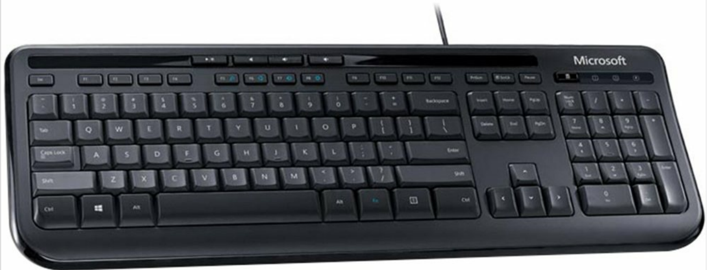
Image: The Microsoft Wired Keyboard 600, showing its USB cable connection. Simply plug the USB cable into an available port on your computer to begin setup.