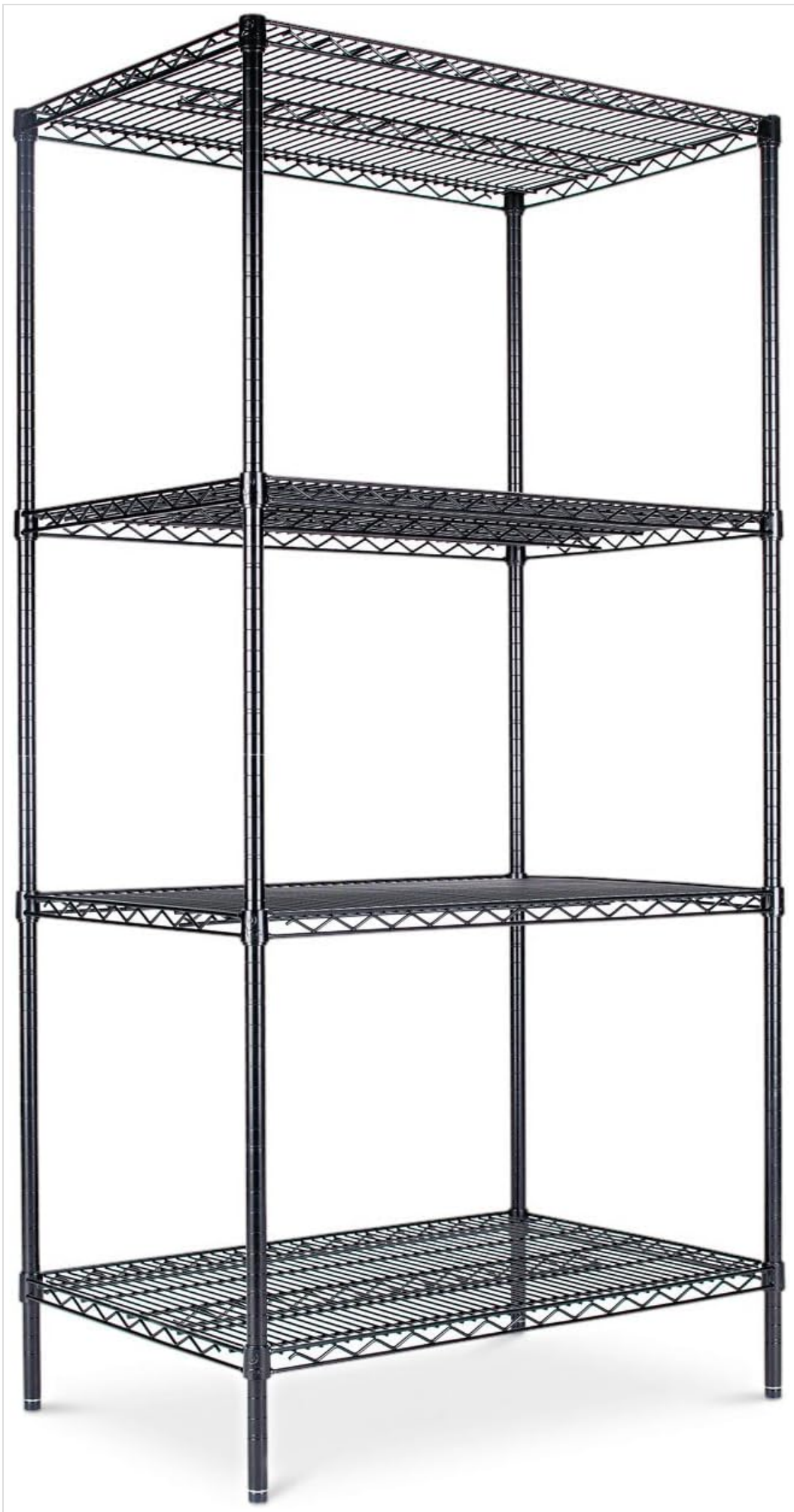
A full view of the assembled Alera Industrial Heavy-Duty Wire Shelving Starter Kit in black, featuring four wire shelves and