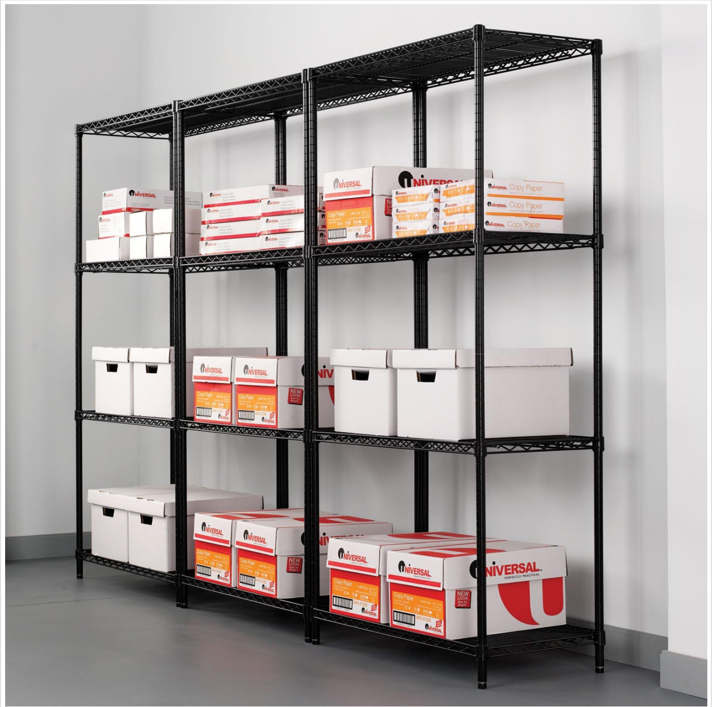
An Alera wire shelving unit in a storage setting, showcasing its capacity to hold multiple boxes and items, demonstrating practical use.