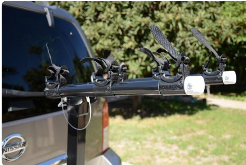
Image: Detailed view of the individual tie-down cradles on the rack's carry arms, designed to secure and protect bicycles.