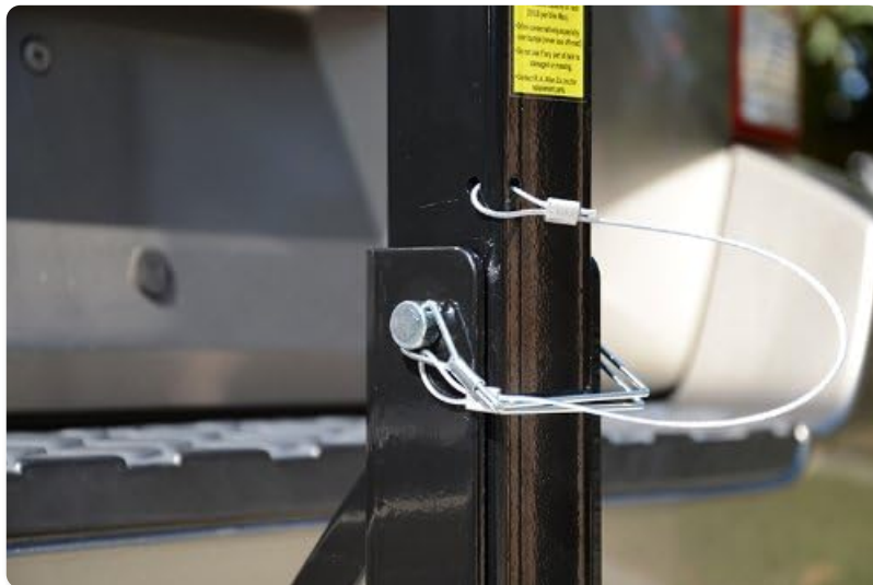
Image: Close-up view of the hitch pin and bolt mechanism, showing how the rack connects to the vehicle's receiver.