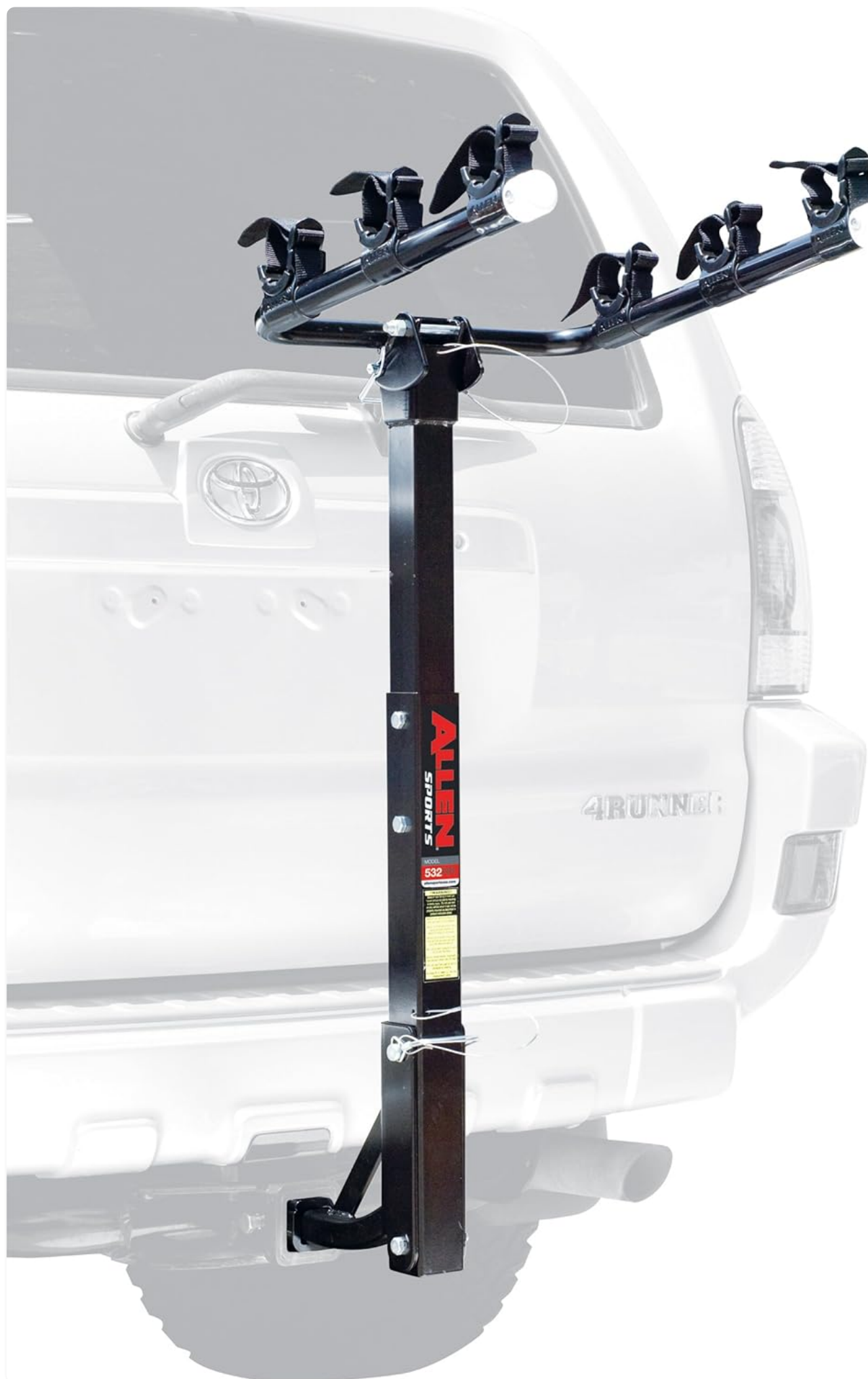
Image: The Allen Deluxe 3-Bike Hitch Mount Rack securely installed on the rear of an SUV, demonstrating its upright position.