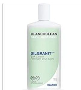
Image: BLANCOCLEAN Daily Silgranit Sink Cleaner, recommended for maintaining the sink's surface.