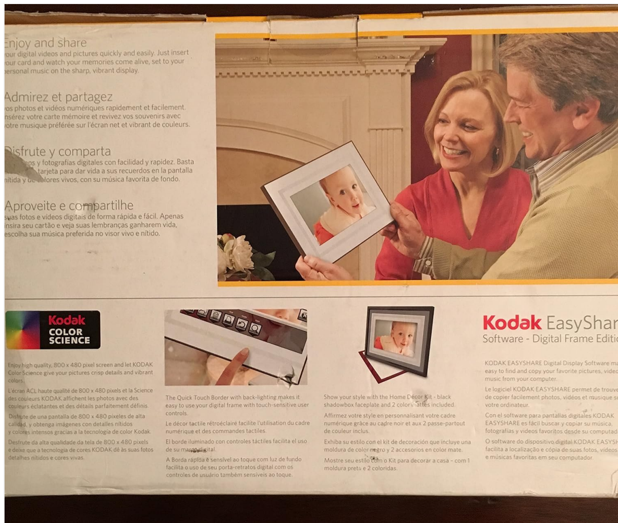
Image 2.1: Close-up of the Kodak Easyshare M820 Digital Frame. This image highlights the Quick Touch Border controls and the screen displaying a photo.