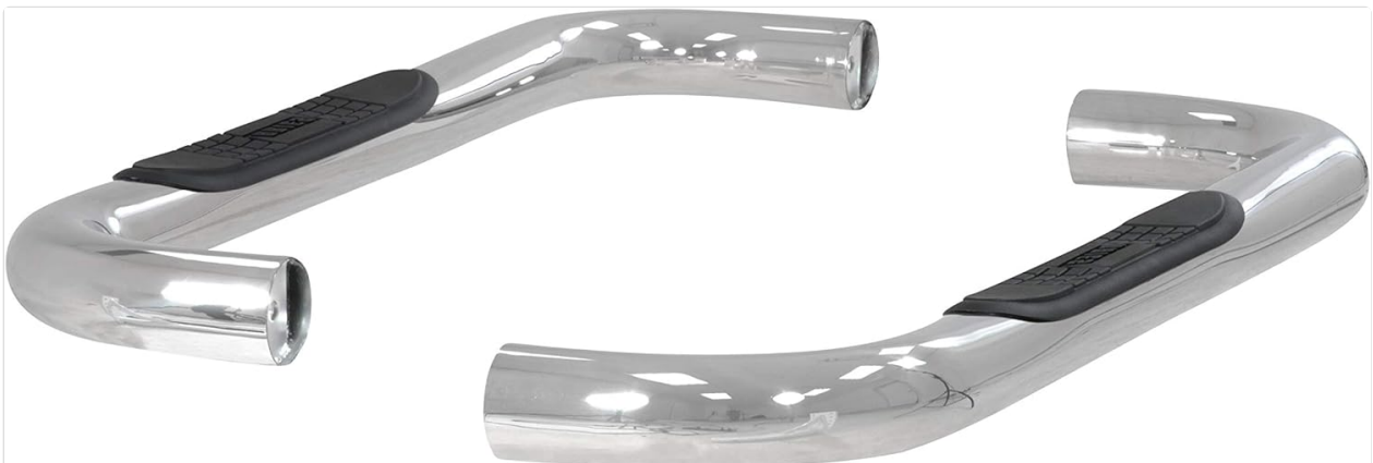
Image 1.1: A pair of ARIES 3-inch round polished stainless steel nerf bars, featuring black non-skid step pads. These bars are designed for vehicle-specific fitment.

This manual provides detailed instructions for the installation, operation, and maintenance of your ARIES 204017-2 3-Inch Round Polished Stainless Steel Nerf Bars. These side bars are designed to offer a custom fit and dependable footing for your vehicle, enhancing both accessibility and appearance. Please read this manual thoroughly before installation and use to ensure proper function and longevity of the product.