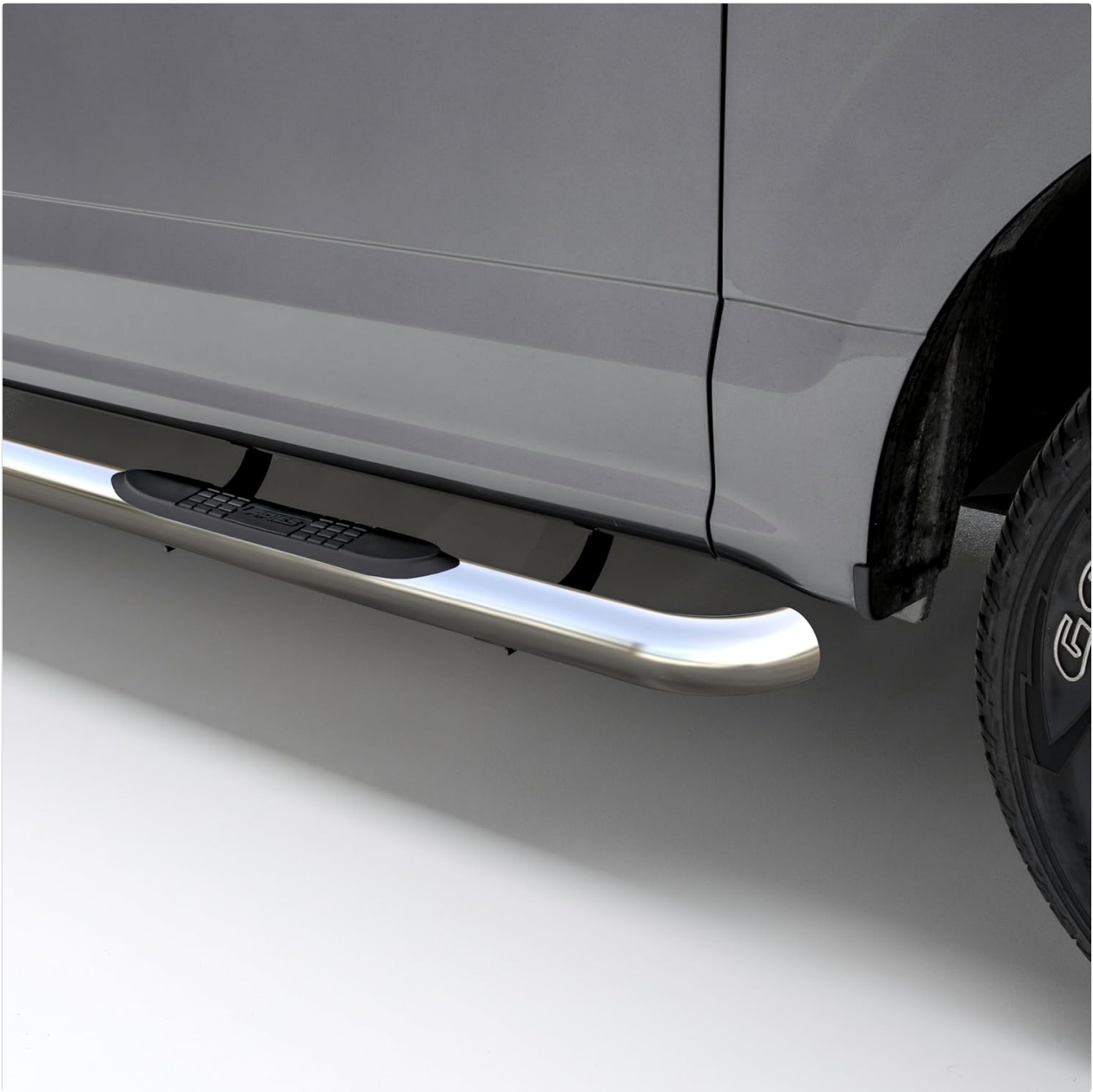
Image 4.2: An ARIES nerf bar seamlessly installed on a truck, demonstrating the product's integrated appearance.