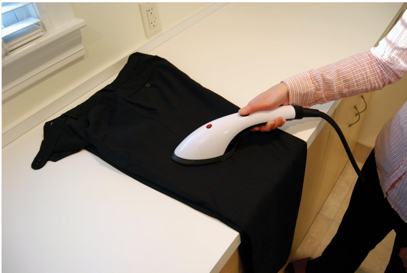
Image Description: A person is using the handheld ironing head of the SteamFast SF-434 to press a pair of black pants laid flat on a white surface. The nonstick soleplate is in direct contact with the fabric.