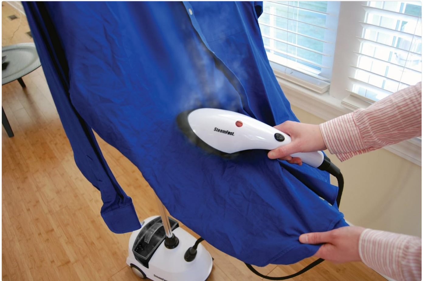
Image Description: A close-up view of a person's hands holding a blue shirt taut while using the SteamFast SF-434 steaming head to remove wrinkles. Steam is clearly visible.

Image Description: A person is using the SteamFast SF-434 to steam a green striped shirt hanging on the unit's integrated hanger. Steam is visibly emanating from the handheld head as it glides over the fabric.