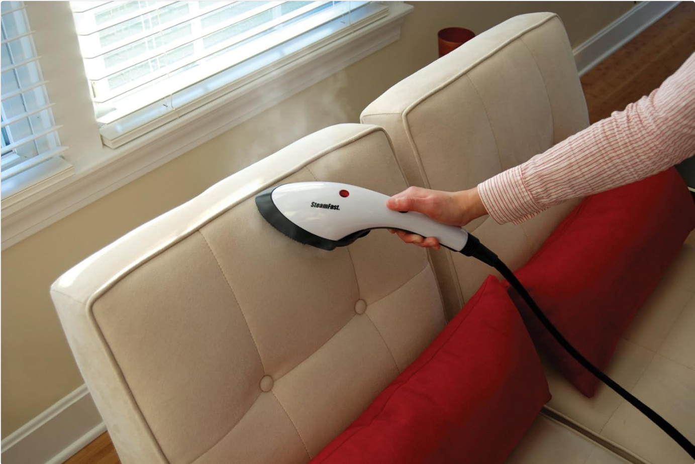
Image Description: A person is using the SteamFast SF-434 handheld unit to steam the backrest of a light-colored sofa, demonstrating its versatility for refreshing upholstery.

The SF-434 can also be used to refresh upholstery, drapes, and other household fabrics. Hold the steaming head a few inches away and move slowly. Always test on an inconspicuous area first.