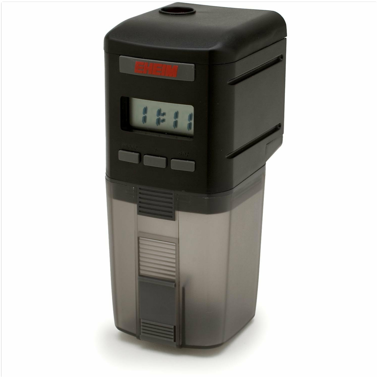
Figure 1: The EHEIM Everyday Fish Feeder in action, dispensing food into an aquarium.

Your browser does not support the video tag.