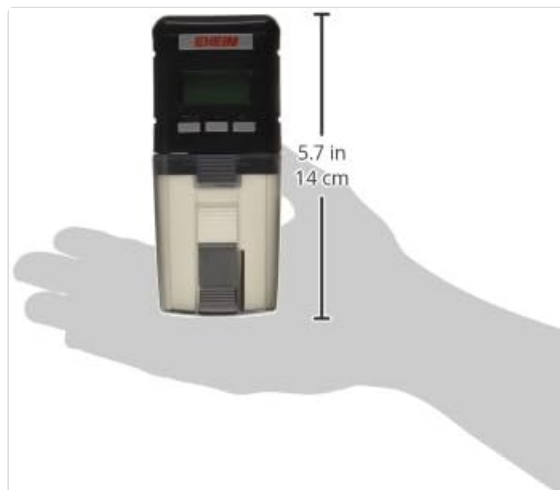
Figure 3: Side view of the EHEIM Everyday Fish Feeder, illustrating its compact dimensions (5.7 inches / 14 cm height).