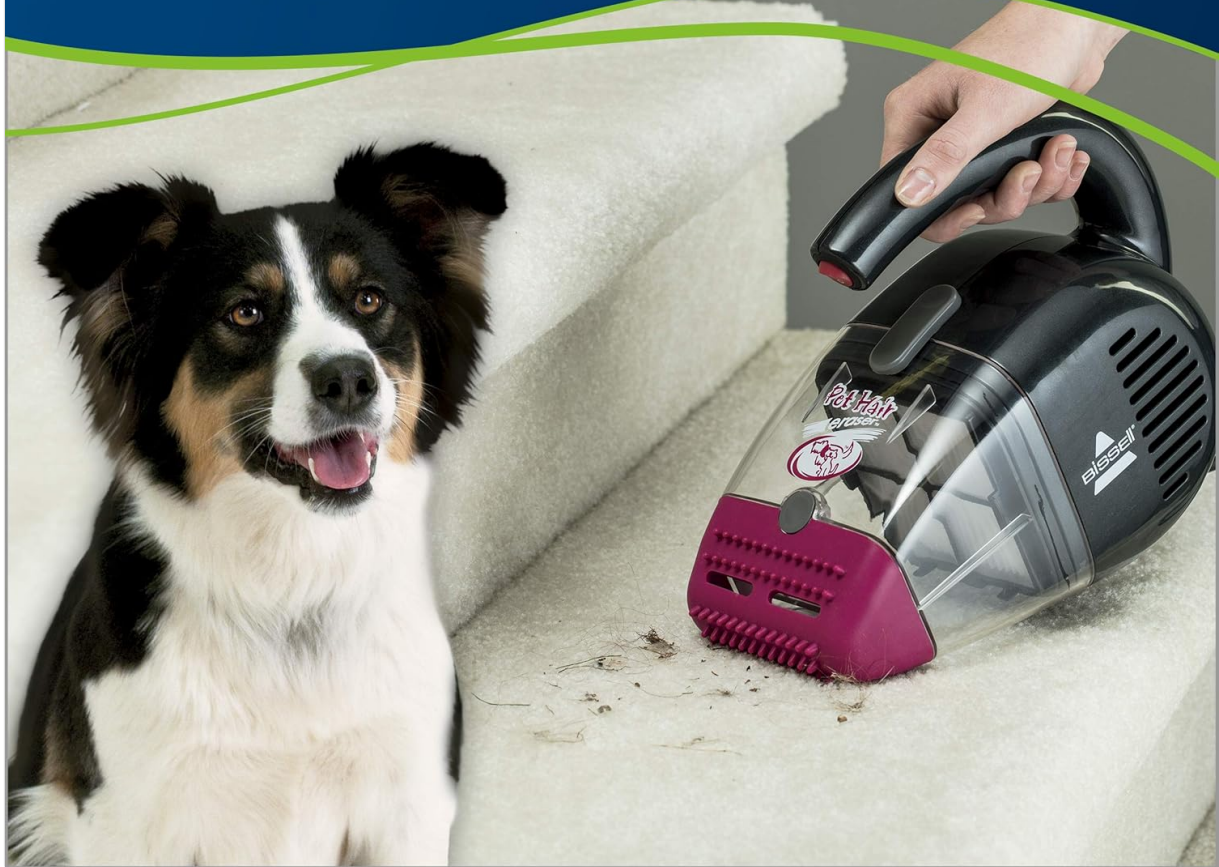
Image: A hand using the Bissell Pet Eraser Hand Vac with the flexible rubber contour nozzle to clean pet hair from carpeted stairs.